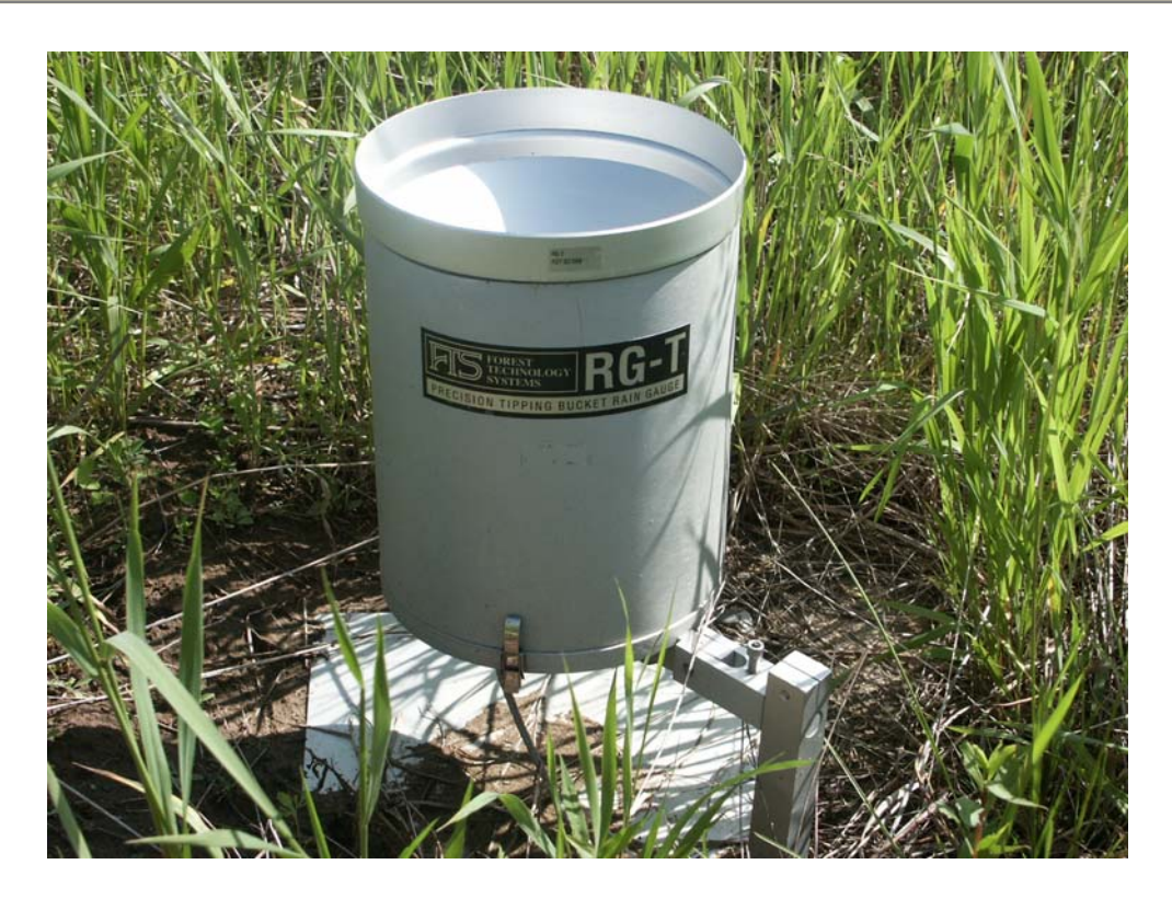
RG-T Tipping Rain Gauge