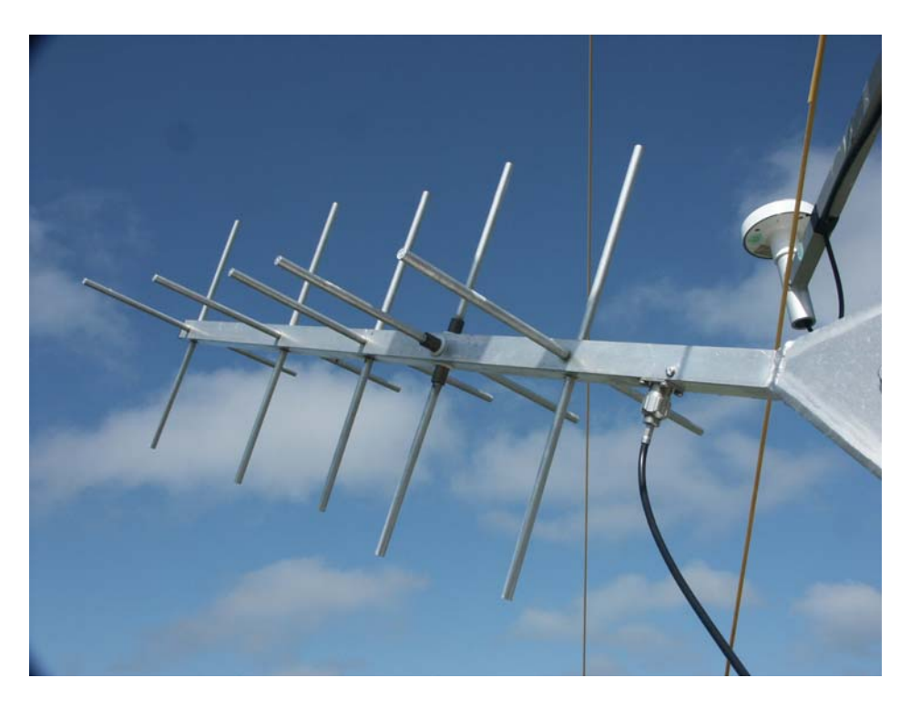
GOES Satellite Antennae