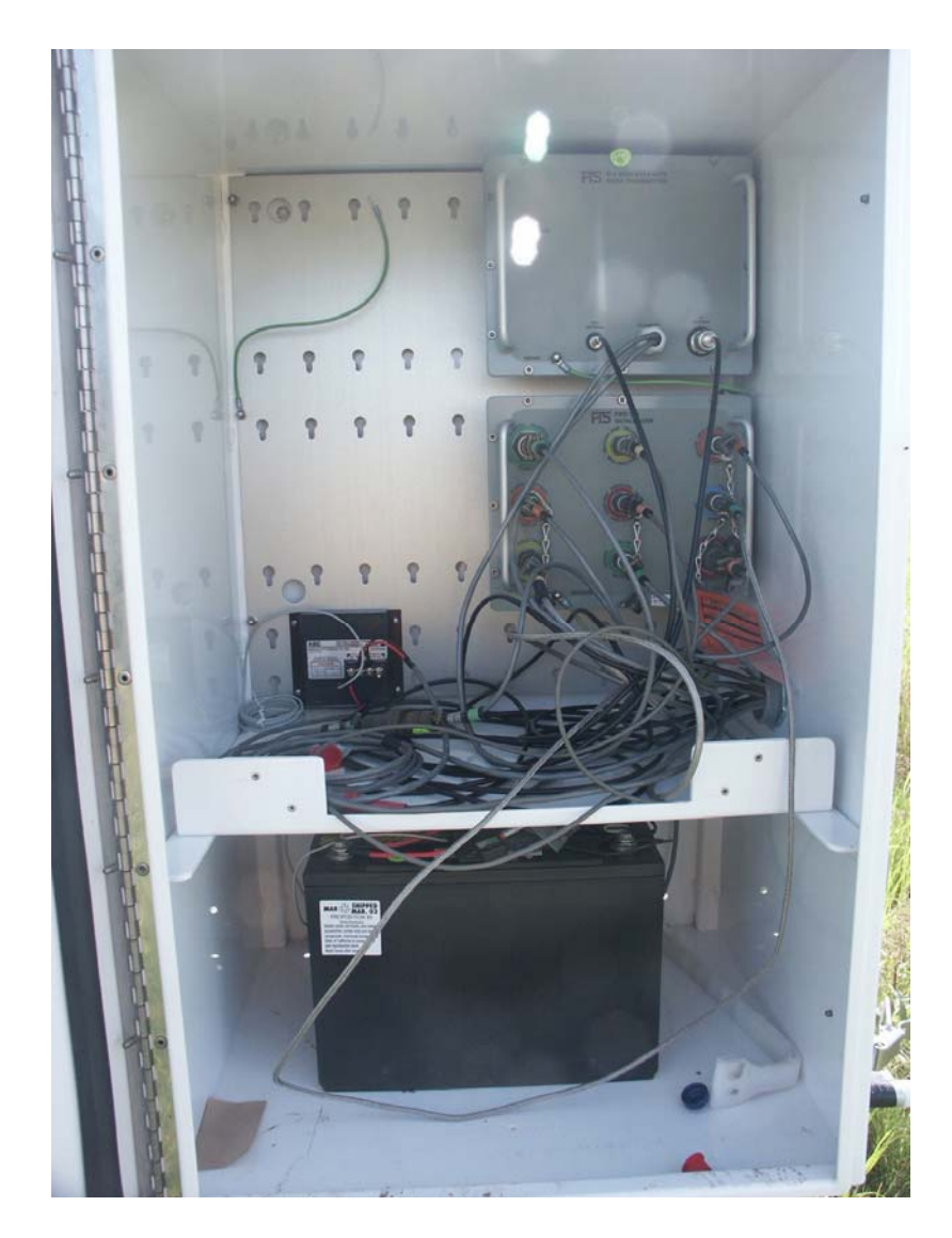
Interior View of RAWS showing FWS-11 Data Logger. All of the data from the sensors is stored here.

GOES puts the data into the "transmit" buffer 2 minutes before transmittal time.