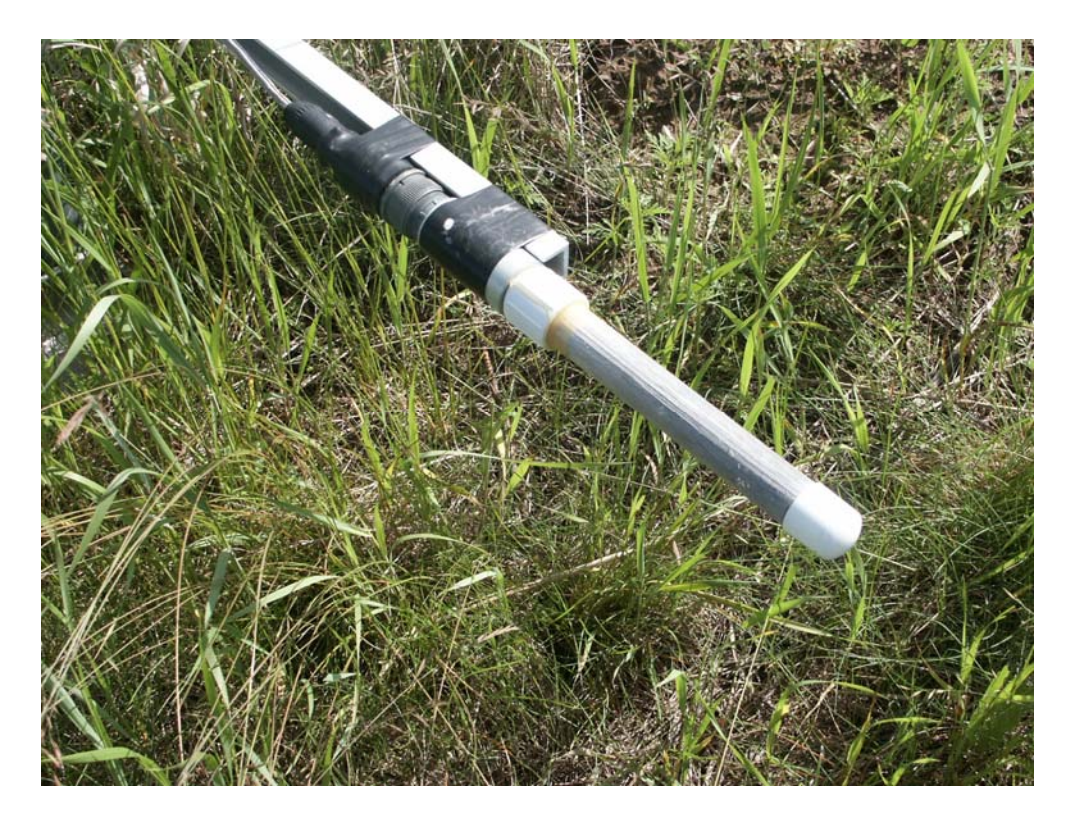
Fuel Moisture Stick