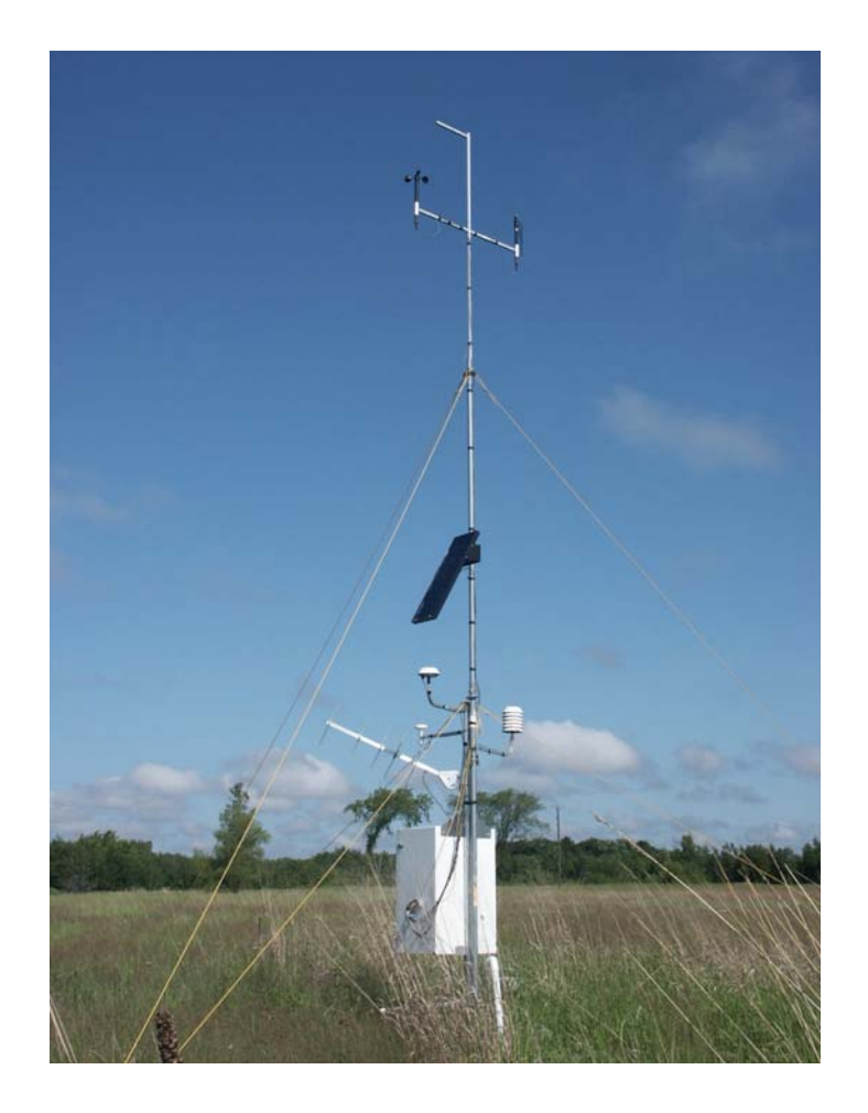
RAWS located on the Sherburne National Wildlife Refuge Zimmerman, MN