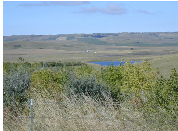
Ground Level View