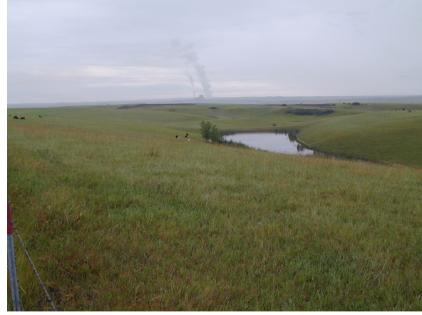
Ground Level View