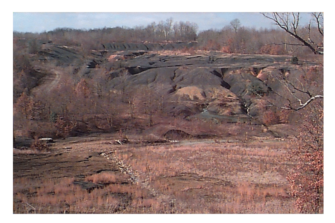
Burning gob pile in the Black Fork drainage to Moxahala Creek

<u>Moxahala Creek</u> - Ohio University s characterization of this watershed, with its focus on the Black Fork tributary, continued this year. They are monitoring an existing wetland treatment system and analyzing it for potential improvements. They are also studying a burning gob pile to determine the best reclamation approach. The Moxahala Watershed Restoration Committee has received a grant from Rivernet to write an action plan and to conduct promotional activities for the watershed. They hired someone to write the action plan. They sponsored a watershed tour and dinner in October.