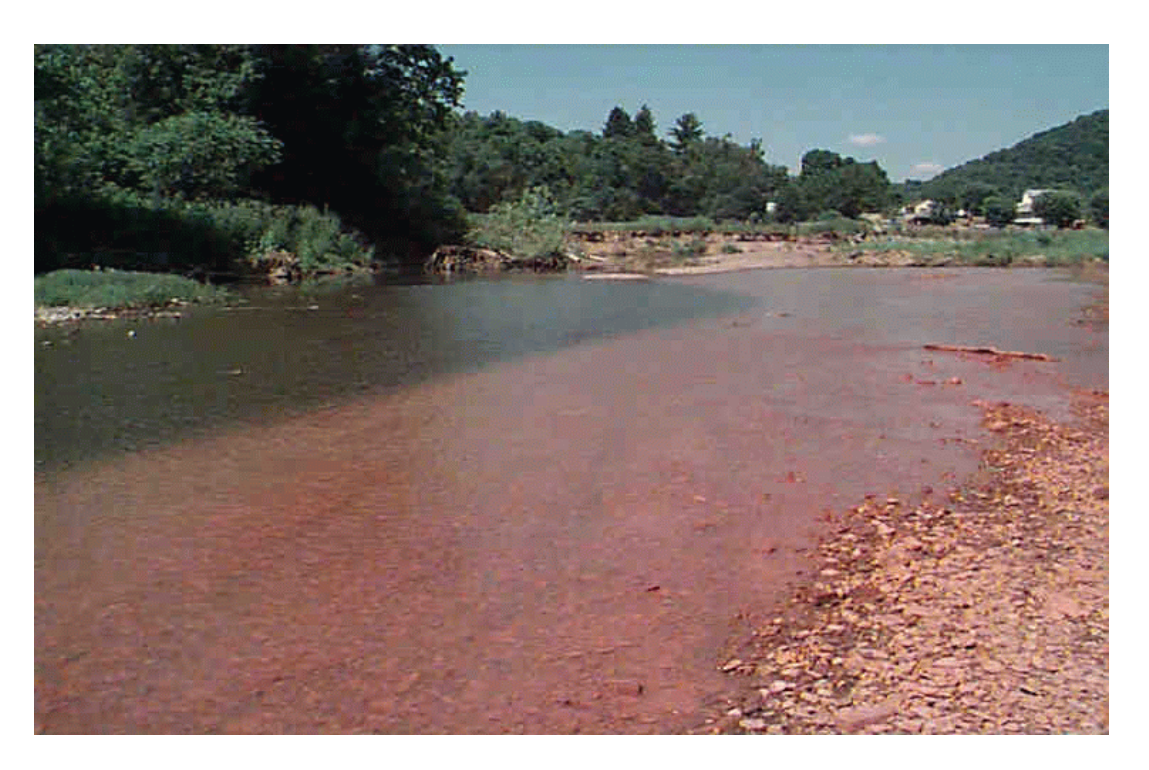
Yellow Creek where the North Fork enters the main stem

<u>Yellow Creek</u> - The Yellow Creek Watershed Restoration Committee meets regularly, and has begun to assess the water quality in their watershed. DMR and the ACOE have entered into a cost-sharing agreement to abate a significant AMD problem on the North Fork of Yellow Creek near the Village of Hammondsville. This discharge also adversely affects the main stem of Yellow Creek.