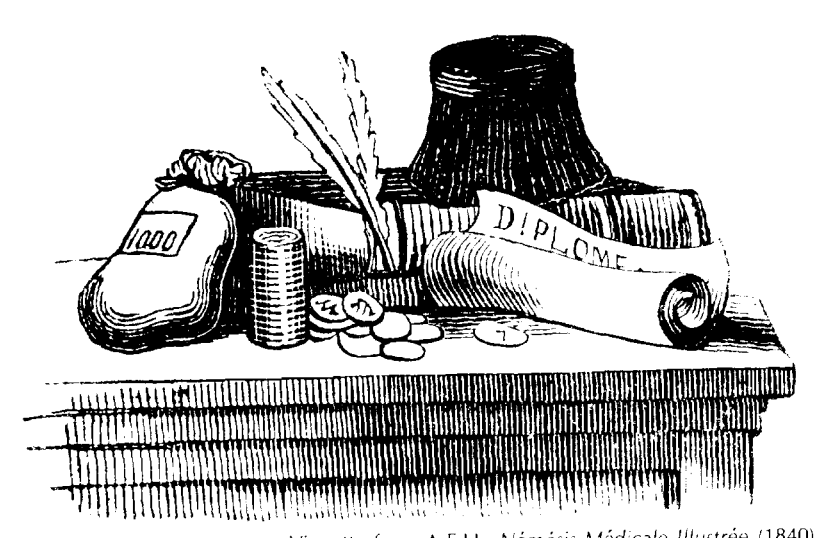
Vignette from A.F.H., Némésis Médicale Illustrée (1840).