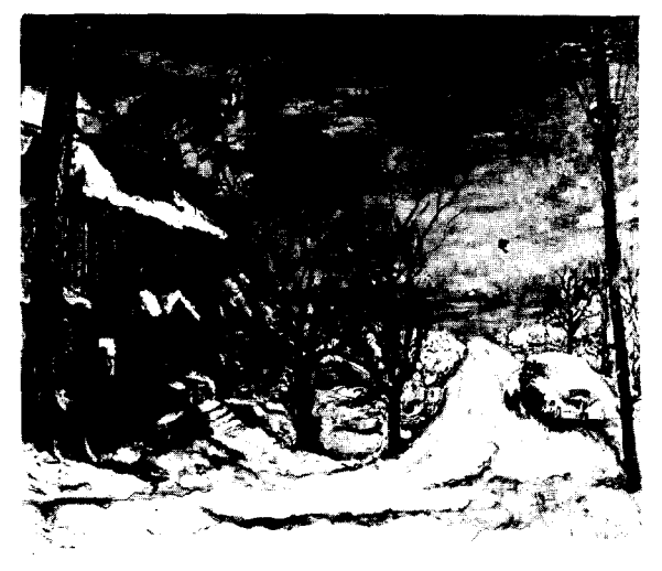
2. Night Call.