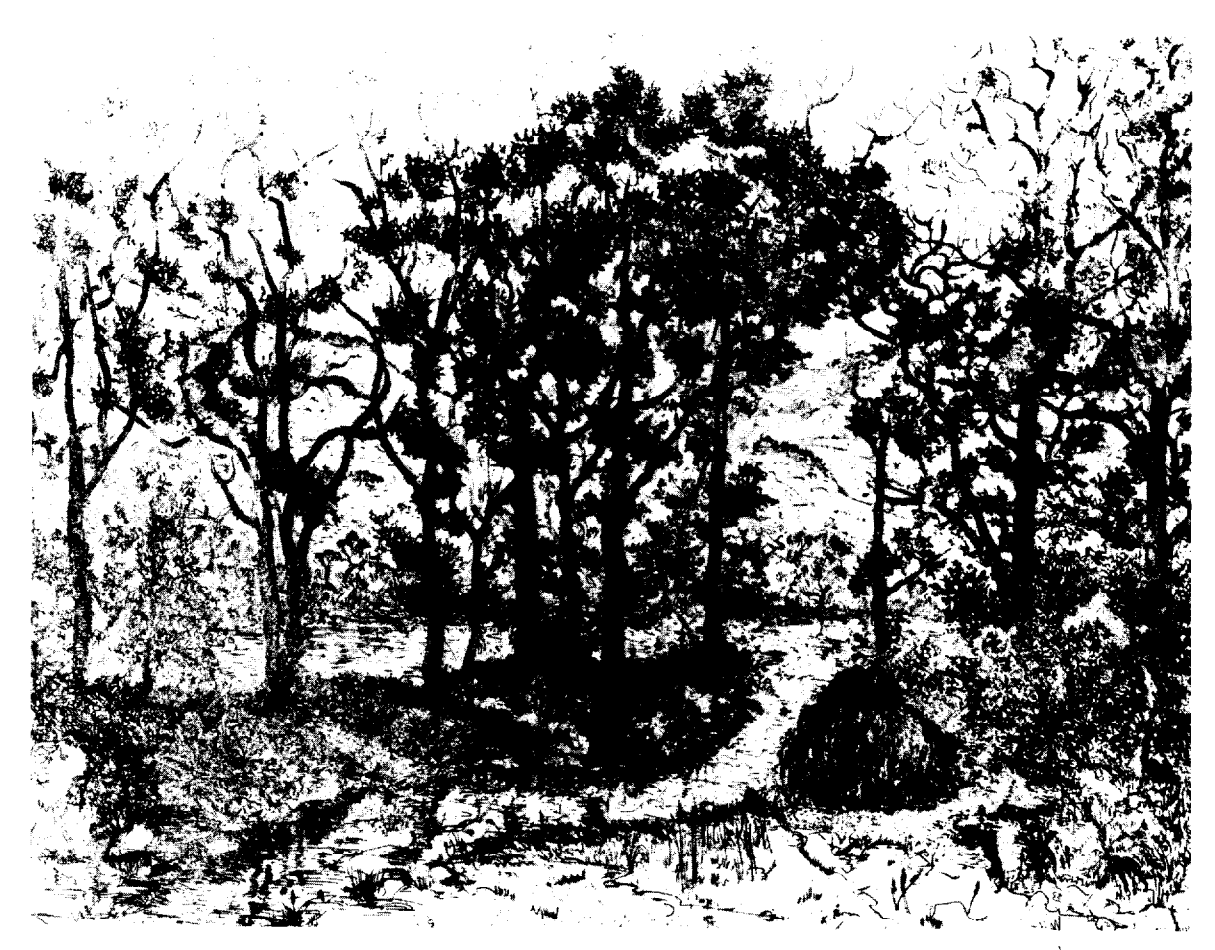
15. Locust Trees, Westchester, New York, 1933.