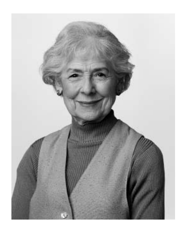
I didn't know what to expect when I needed skilled care. Then the social worker at the hospital gave me this booklet to read. I'm so glad she did.

If you or someone you care for needs SNF (<u>Skilled N</u>ursing <u>Facility</u>) care, read this booklet so you will know: