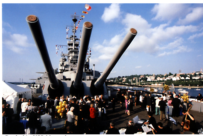
Battleship USS Massachusetts

All descriptions of web sites and companies come from each web site or their public affairs official -- in their own words and with their permission.