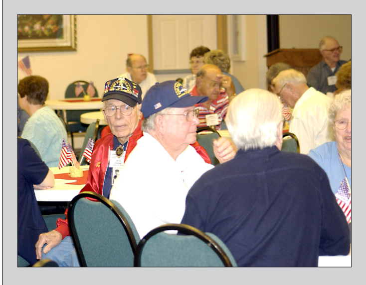
Members of USS Portland (CA-33)

Branson is a great place for reunions with many big name stars who appear daily in theaters around the small town and show their appreciation and support for Veterans and active duty members of the military.