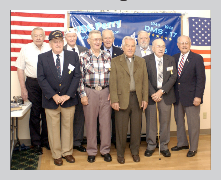
Members of USS Perry (DD-844/DMS-17)