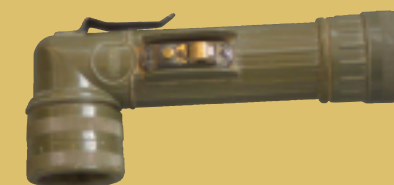
Flashlight: Known to recruits as "moonbeams."