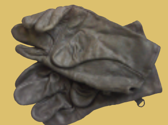
Gloves: Makes handling razor wire a more pleasant experience.