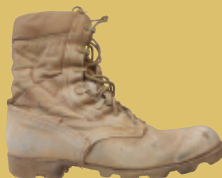
Boot: For carrying the rest of the gear.