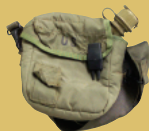
2 Qt. Bottle: Two quarts of thirst-quenching bleach water.