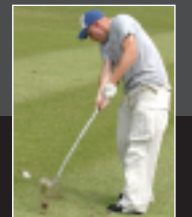
< Sept. 11-18 All Marine Golf Trials, Twentynine Palms, Calif.