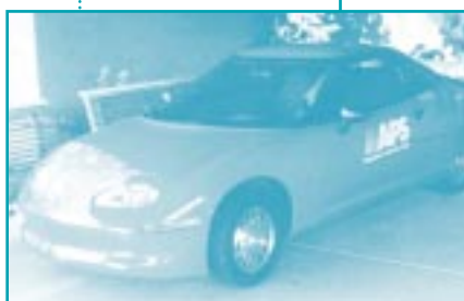
◀ GM's EV1 electric car, owned by Arizona Public Service, was on display at the conference. GM currently is leasing the EV1 in Arizona and California.