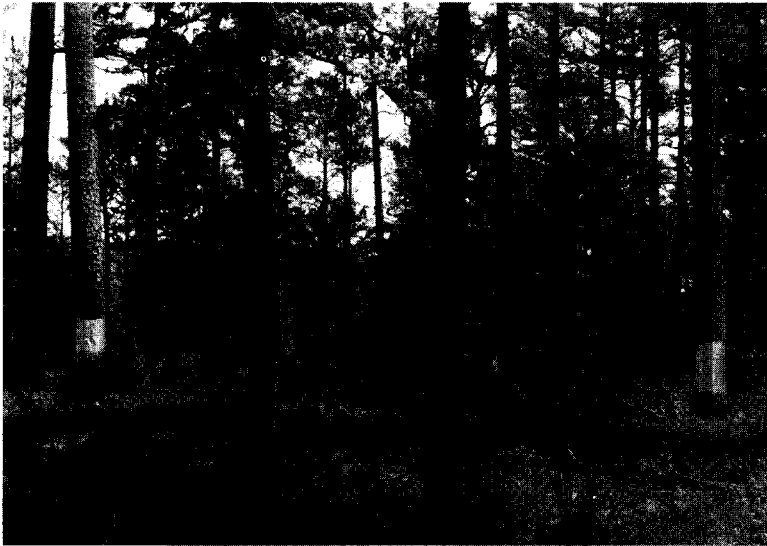
Understory conditions in a shortleaf pine stand under even-aged management for red-cockaded woodpecker habitat in the Poteau Ranger District, Ouachita National Forest.

tial areas of existing forest types are scheduled for eventual longleaf restoration (U.S. Dep. Agric. For. Serv., unpubl. data). However, restoration will require more than a century to effect. In the meantime, the existing pine types other than longleaf will be critical components of red-cockaded woodpecker habitat.