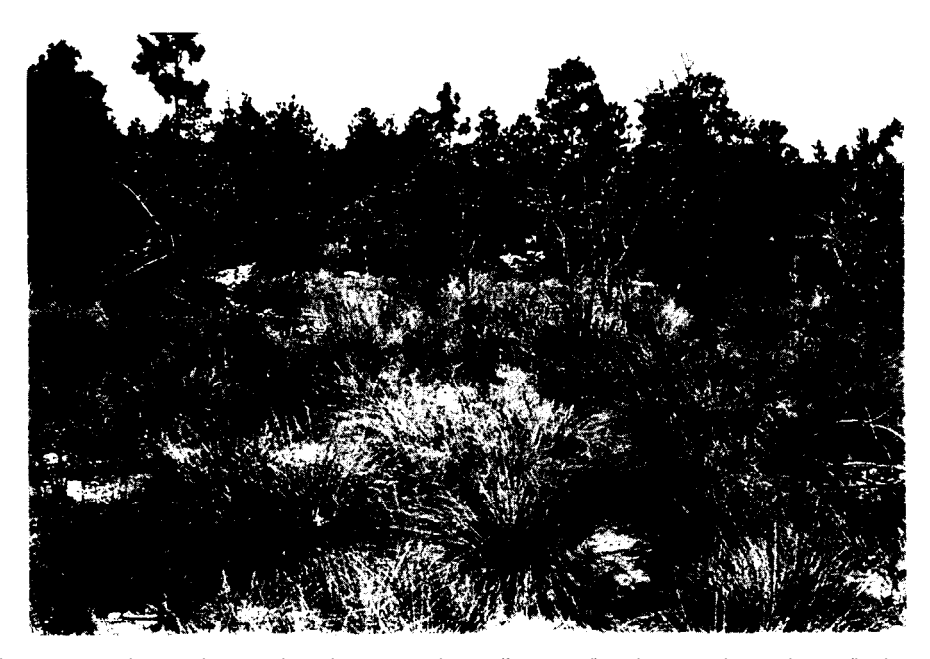
Fig. 1. Contrast in overstory oak cover between hexazinone treated area (foreground) and untreated control area (background) two growing seasons following treatment.

for all hexazinone treatments. While wiregrass cover was nearly comparable on all applications, ranging from 60 to nearly 70% foliar cover, the largest overall increase (89%) and only significant increase (p = 0.09) was observed for the 2.2 kg/ha treatment. By the second and third growing seasons, wiregrass on plots receiving the broadcast 1.1 kg/ha treatment expanded to coverage comparable to that found on the other treatments. The smallest increase in wiregrass cover was noted on control plots where oak canopies continued to expand.