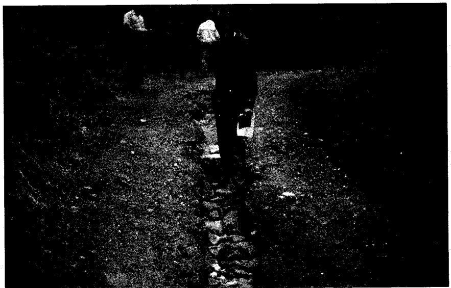
The local community had used this orphan road for a long time, but it was not maintained by any organization or desired by the landowner. Efforts to halt erosion by closing this roadway were resisted by the county government, which initially was also unwilling to assume responsibility for its restoration and maintenance.

Road management in the Appalachian Mountains is complex be-