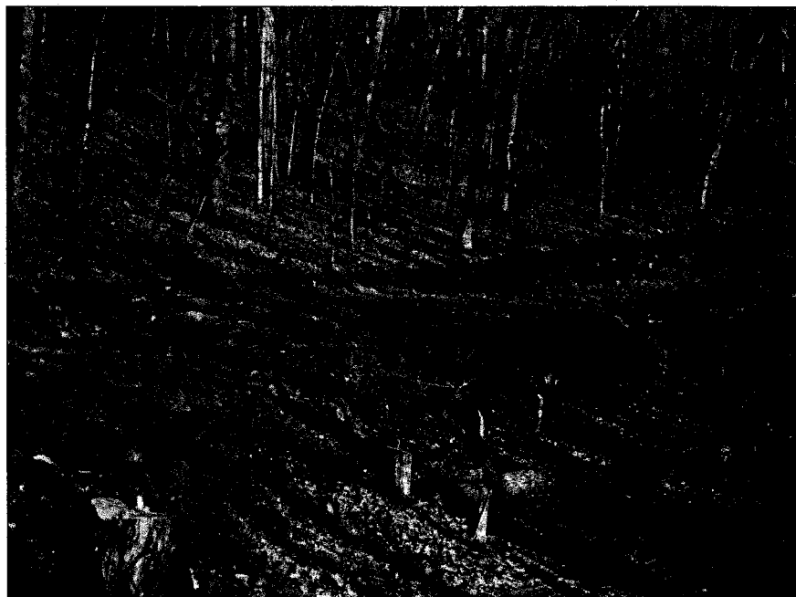
The broad-based dip is a road drainage structure that places a reverse grade in the roadbed. The dip is designed to intercept and turn storm runoff from the outsloped roadbed and onto the forest floor, where the water infiltrates and sediment is trapped. The broad-based dip, a less abrupt structure than the typical waterbar, may be traversed by highway vehicles when the roadbed is dry.

Stream crossings are the major source of sediment. Road sections near crossings were often constructed with ditches that drain directly into the channels. Additional ditch outlets