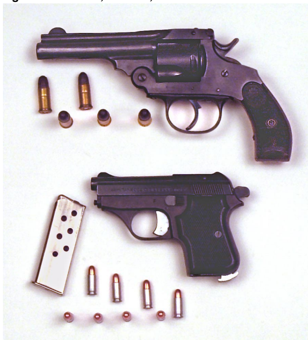
Figure 5: Tucson, Arizona, Purchases

.38 Caliber Spanish-Manufactured Half-Break 5-Shot Revolver, Circa 1893, With .38 Caliber Ammunition (Top)