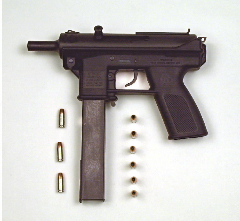
Model AB-10 Intratec 9mm Semiautomatic Pistol With 32-Shot Magazine and 9mm 124-Grain Hydra-Shok Jacketed Hollow-Point Ammunition

FFLs are required to make entries on the ATF Form 4473 for the sale of firearms and include on the form the name of the intended recipient of the firearm. Title 18 U.S.C. § 924(a) provides that whoever knowingly makes any false statement or representation in the records required to be kept for the sale of firearms shall be fined, imprisoned for 5 years, or both. Further, instructions for ATF Form 4473 warn that “[A] licensee who knowingly delivers a firearm to an individual who is not buying the firearm for himself or herself or as a gift violates the law by maintaining a false ATF F [Form] 4473.” In this instance, the FFL may have violated the law by selling a firearm to an individual who he knew was not the intended recipient.