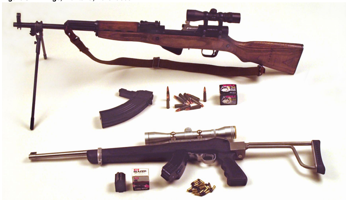
Figure 3: Billings, Montana, Purchases

7.62mm Russian-Manufactured Samozariadnyia Karabina Simonova Semiautomatic Rifle With Bipod Rest, 4x Scope, 30-Round Banana Clip, and 7.62mm Ammunition (Top)