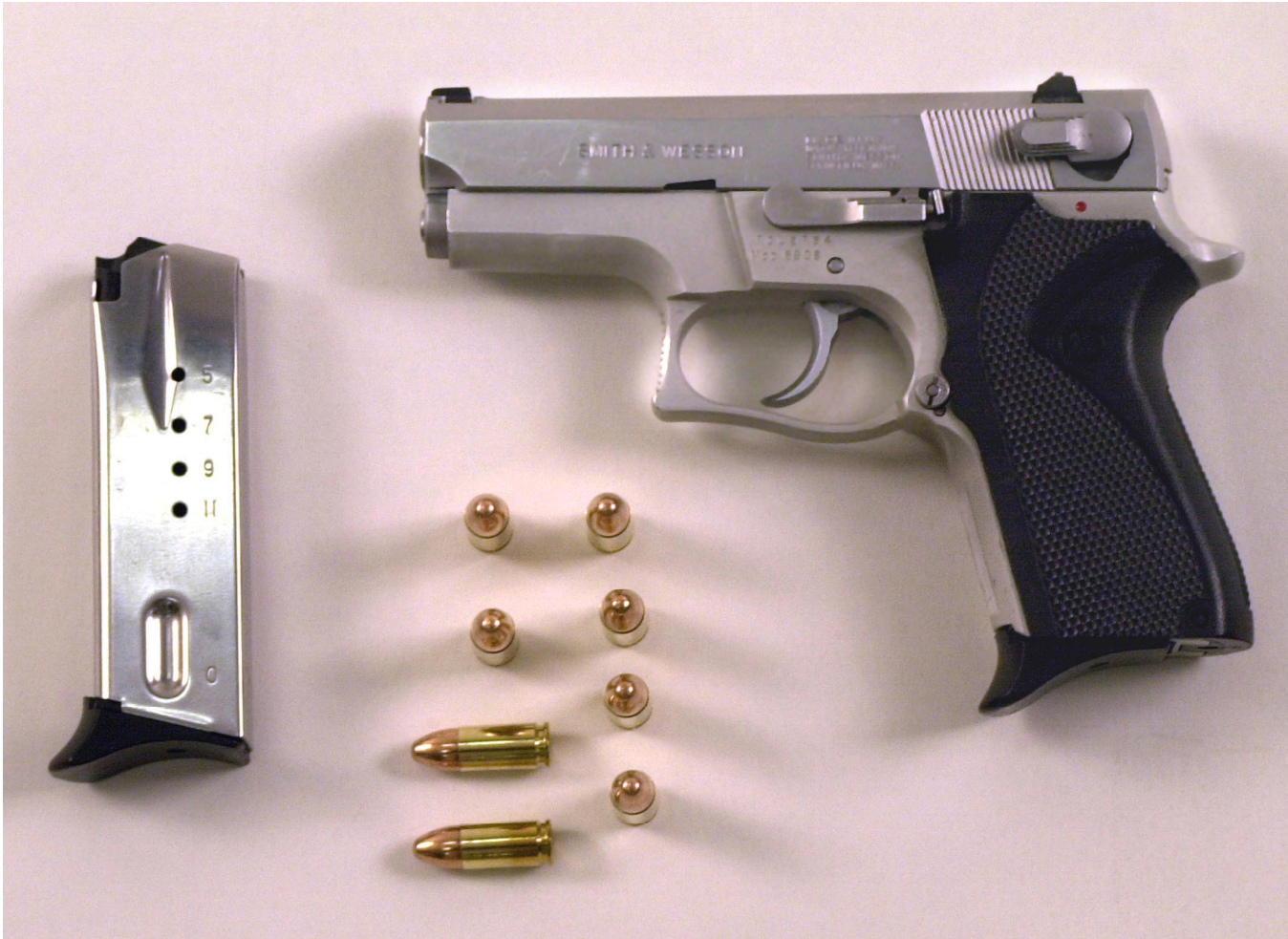
Model 6906 Smith & Wesson 9mm Stainless Steel Semiautomatic Pistol With 12-Round Ammunition Magazine

The gun store salesperson requested that the agent complete ATF Form 4473 and a Virginia State Police firearm purchase form. After checking both forms to make sure information provided was identical and complete, the salesperson ran the standard instant background check on the fictitious name, date of birth, and social security number provided by the undercover agent. He also provided the same information to the Virginia State Police for a state criminal record check. The records checks by both NICS and the Virginia State Police immediately came back with a proceed-to-sell response, meaning that no criminal record was associated with the