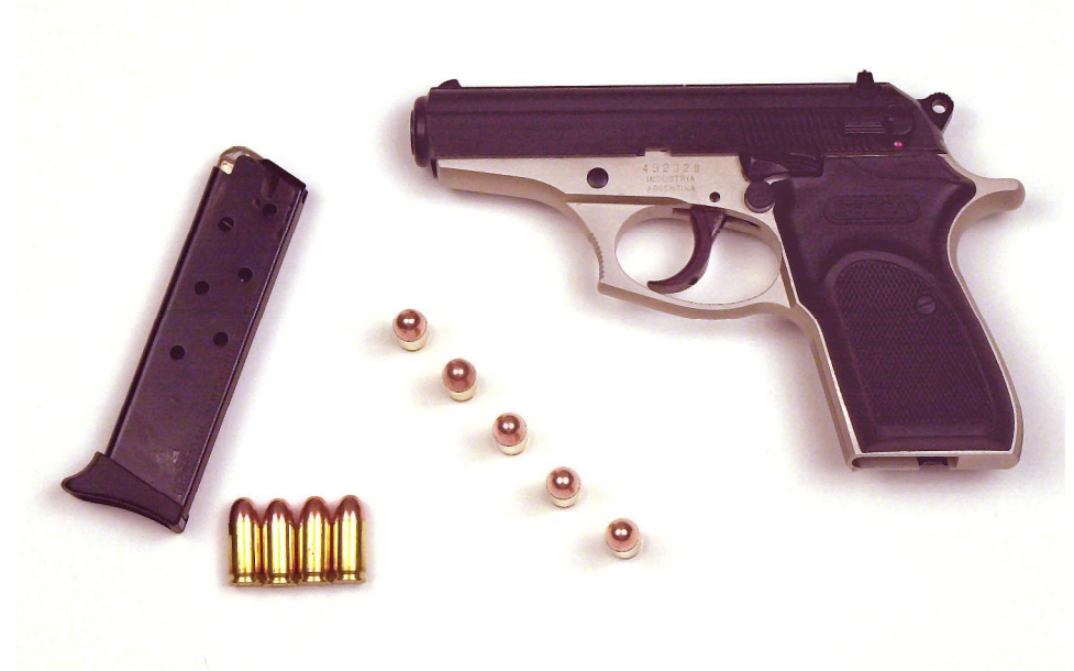
.380 Bresa Semiautomatic Pistol With 8-Round Magazine and .380 Ammunition

The agent presented a counterfeit West Virginia driver's license and completed the ATF Form 4473. The initial NICS check by the salesperson came back with a delay response, indicating that the system was either down or that the name, date of birth, and/or social security number submitted was similar to ones associated with a criminal history. The salesperson told the agent that NICS had 3 business days from the time he called in the name-check to respond and that if NICS did not respond within that period, he could sell the firearm to the agent. During this transaction, the salesperson stated that his main concern about a delay notification from the NICS was the potential loss of the sale. In this case, the proceed-to-sell order came back from NICS in less than 24 hours. The agent returned to the sporting goods store, paid for the firearm and ammunition, and departed the store with the merchandise and a companion agent.