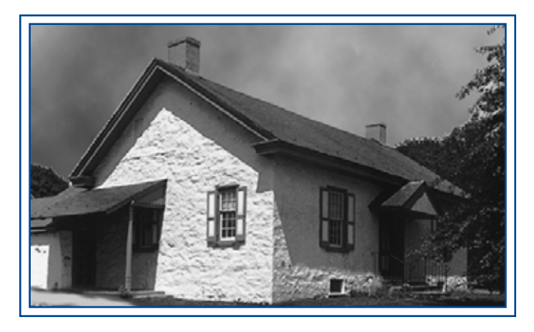
The study will evaluate structures, sites, and buildings associated with the Revolutionary War and the War of 1812. The Hockessin Friends Meeting House in Delaware (shown) housed British troops during the 1777 Philadelphia Campaign.

operations, but they do relate to significant historical themes during the two wars, and they do make important contributions to our overall understanding of the wars. It may seem like an impossible task to identify the thousands of potential associated historic properties, however a strategy has been developed and is being employed by the NPS study team. It includes cooperation among State and Tribal Historic Preservation Offices, National Park Service staff, local jurisdictions, and 18th-century scholars and others. The NPS study team has compiled a starter list of properties already documented and listed in the National Register of Historic Places. The list is expected to expand as data from state inventories and primary and secondary sources is added through the interactive web site. (See article "New Interactive Website for Revolutionary War/War of 1812 Study")