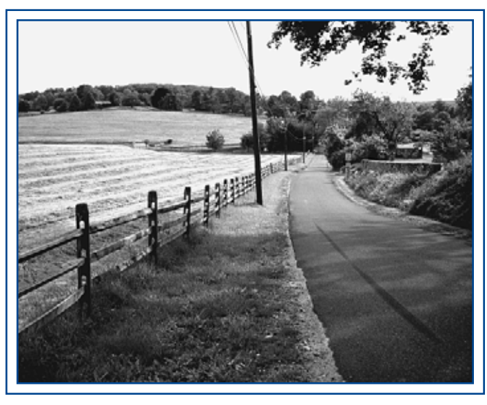
Rural landscape of the Brandywine Battlefield in Chester County, Pennsylvania.