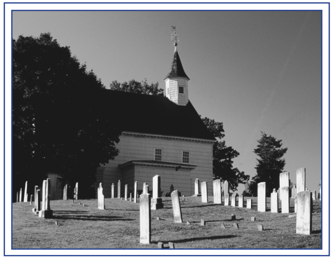
Old Tennent Church was used as a hospital during and after the Battle of Monmouth in 1778.

The conference registration cost for Closing Ranks is $95. This includes the opening reception, the paper presentations, lunch, and the closing banquet. The tours and GIS workshops are not covered by the registration fee. The tour of Saratoga National Historical Park and the tour of Lake George are $35 each. The tour of Fort Montgomery is $25. The GIS workshops are $25 each. Please make checks payable to The Civil War Preservation Trust.