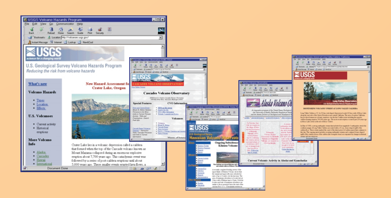
Several USGS websites deliver current information about the USGS Volcano Hazards Program, volcano hazards, and volcanic activity in the United States.