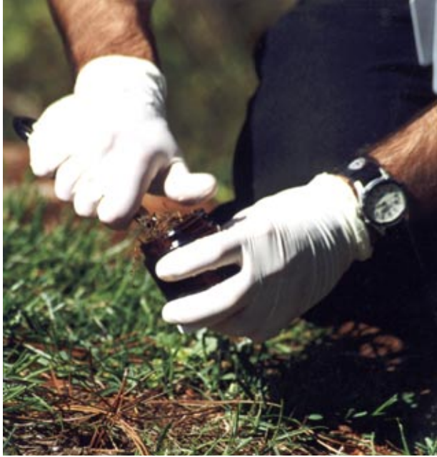
specific environmental information may be derived from soil sampling

obtain specific environmental information or modify their original plans for studying site contaminants.