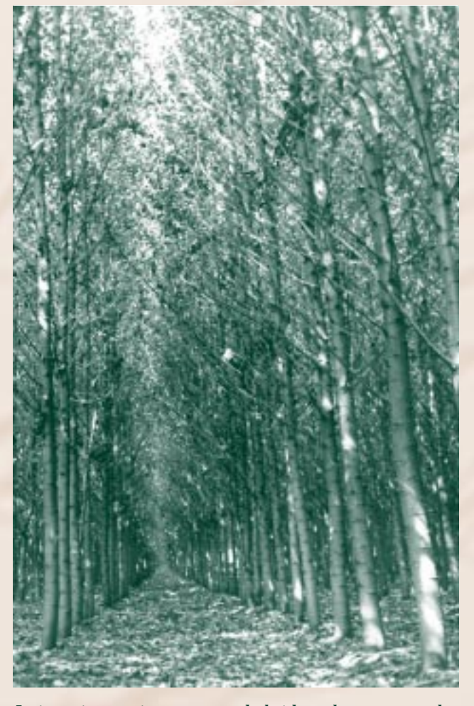
Trees destined for conversion to biofuels can be harvested with the same equipment as trees grown for timber, pulp, or fiber.