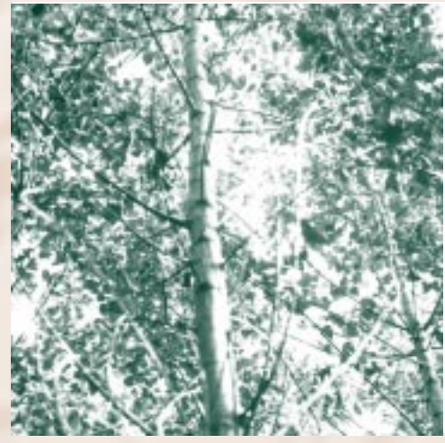
Biofuels researchers have found that a tree's "crown geometry" plays a key role in efficiently converting sunlight into cellulose.