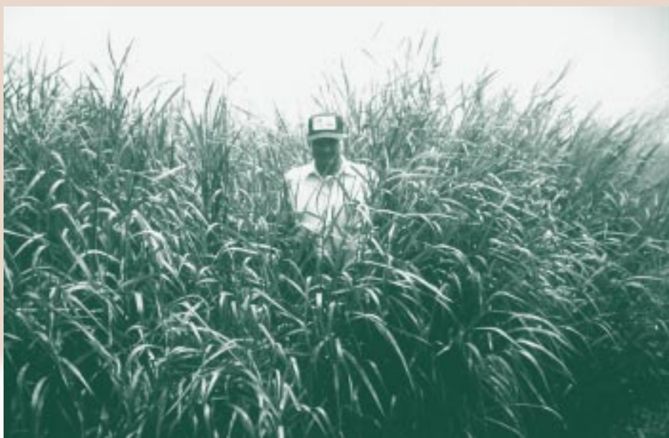
Test plots of switchgrass at Auburn University have produced up to 15 tons per acre in a single year, with eight-year average annual yields at 10 tons per acre. Expected yields in field-scale production are in the range of 5-9 tons per acre, enough to eventually produce 500-900 gallons of ethanol per acre per year.

Many farmers already grow switchgrass, either as forage for livestock or as a ground cover, to