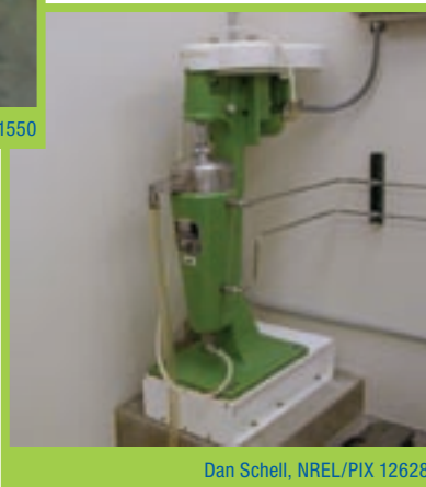
Dan Schell, NREL/PIX 12628