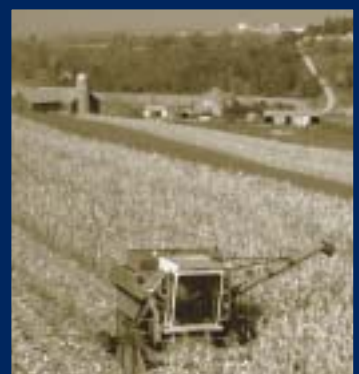
Agriculture Research Service, USDA