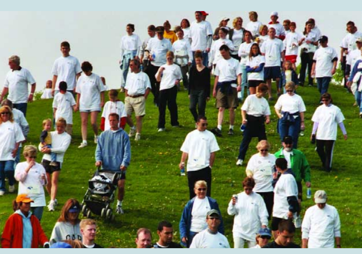
Stepping Out to Cure Scleroderma • Minnesota Chapter Walk