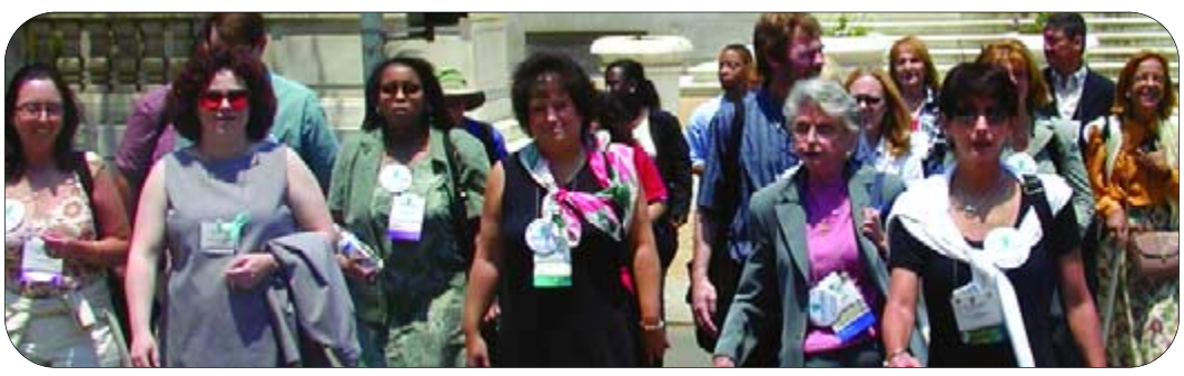
Capitol Hill Day, June 24: Scleroderma Foundation members enjoy the sunshine while walking from building to building in Washington, D.C.