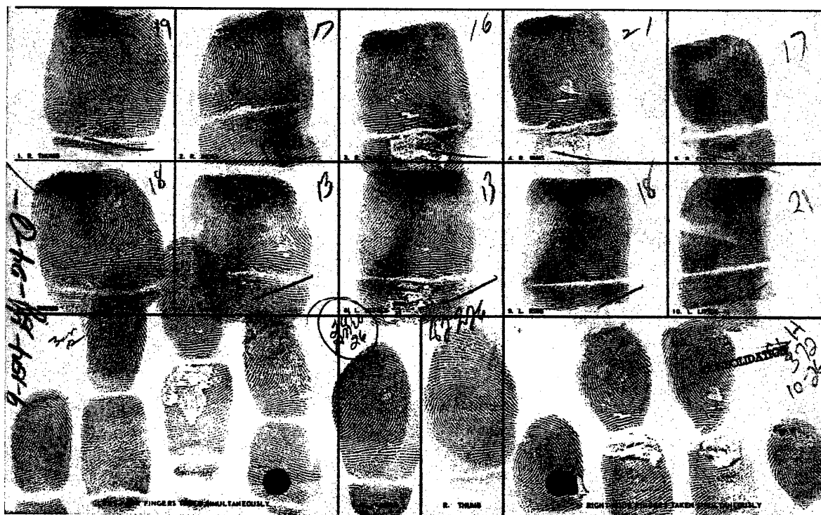
Figure 1 Image of fingerprint card a042.an2 from the database.

ppmm images. The file pairs (a and b for the first character in the filename) are numbered and have the extension “.an2”. All images in the ANSI/NIST records are compressed using JPEGL compression. Figure 1 shows the fingerprint card image for file a042.an2 from the database.