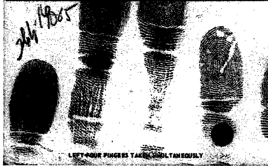
Figure 4 Image where segmentation cuts through the inked fingerprint.