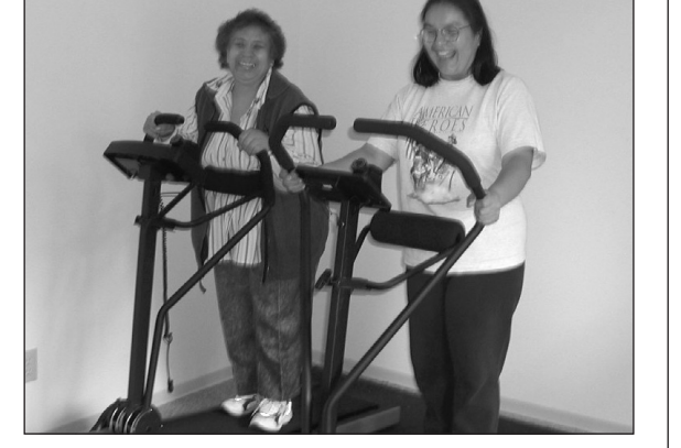
Working out at the Klukwan Fitness Center