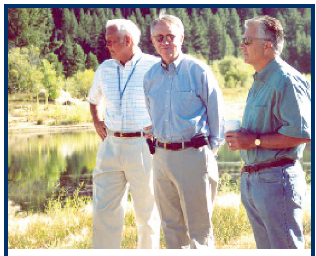
Senator Reid and Senator Ensign at the Lake Tahoe Forum.

I also have worked to protect other areas in Nevada, such as Great Basin National Park, the Ruby Mountains, Red Rock Canyon, Sloan Canyon and Lake Mead. While we have made much progress, I remain strongly committed to preserving and protecting Nevada's natural heritage for the benefit of current and future generations.