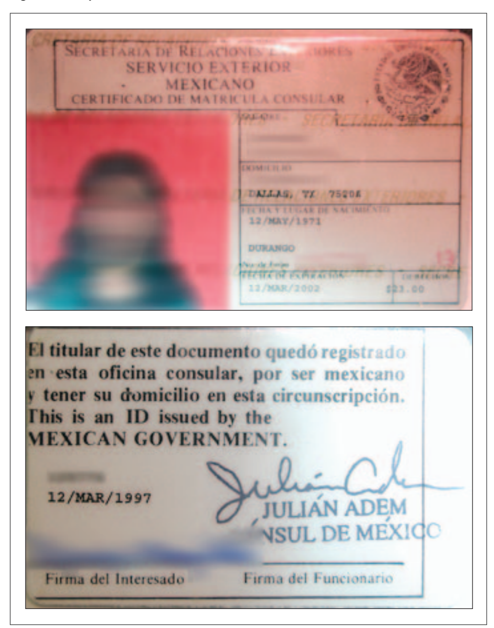
Figure 3: Sample of Laminated Mexican CID card

now in circulation. Prior to that assessment, in March 2002, Mexico began phasing in a new CID card that incorporates various technical security features not contained in the older version of the card (See fig. 4.) This newer card is considered by Mexican officials to be a high-security CID card, compared with the low-security CID card issued earlier.