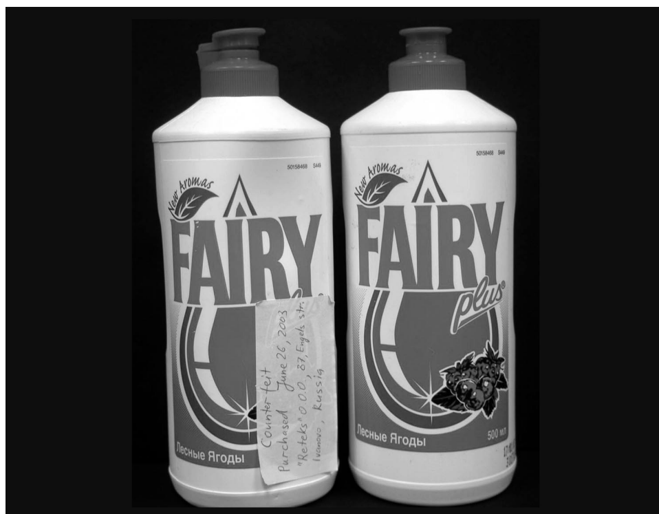
Figure 4: Counterfeit and Legitimate Russian Detergent