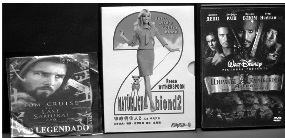
Figure 1: Pirated DVDs from Brazil, China, and Ukraine