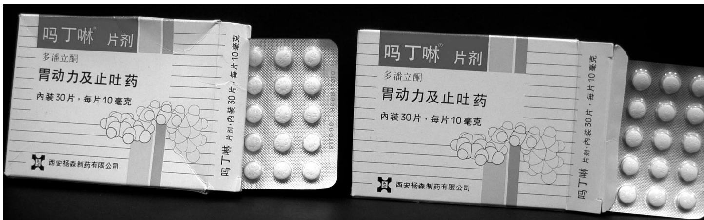
Figure 3: Counterfeit and Legitimate Chinese Pharmaceutical Products

The impact of U.S. activities is affected by a country's own domestic policy objectives and economic interests, which may complement or conflict with U.S. objectives. U.S. efforts are more likely to be effective in encouraging government action or achieving impact in a foreign country if support for intellectual property protection exists there. Groups in a foreign country whose interests align with that of the United States can bolster U.S. efforts. For example, combating music piracy in Brazil has gained political attention and support because Brazil has a viable domestic music industry and thus has domestic interests that have become victims of widespread piracy. Further, according to a police official in Rio de Janeiro, efforts to crack down on street vendors are motivated by the loss of tax revenues from the informal economy. The unintended effect of these local Brazilian efforts has been a crackdown on counterfeiting activities because the informal economy is often involved in selling pirated and counterfeit goods on the streets. Likewise, the Chinese government has been working with a U.S. pharmaceutical company on medicines safety training to reduce the amount of fake medicines produced in China (see fig. 3).