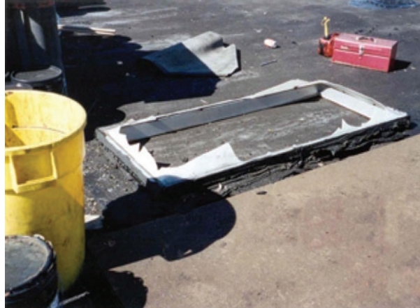
Figure 4. Rectangular skylight after it had been removed from the roof and placed on the ground.

A 14-year-old male laborer died from injuries he sustained when he fell through the lens of a 56- x 24-inch, curb-mounted skylight to a concrete floor approximately 12 feet below (Figure 4). Along with several other day laborers, the victim and his 16-year-old brother had been hired by a roofing contractor on the day of the incident to pull up and remove built-up roofing materials from the flat roof of a one-story wholesale florist shop. The victim had been working for approximately 15 minutes pulling up roofing materials by hand when he fell back onto a skylight lens that broke under his weight. The skylight did not have a protective screen, cover, or