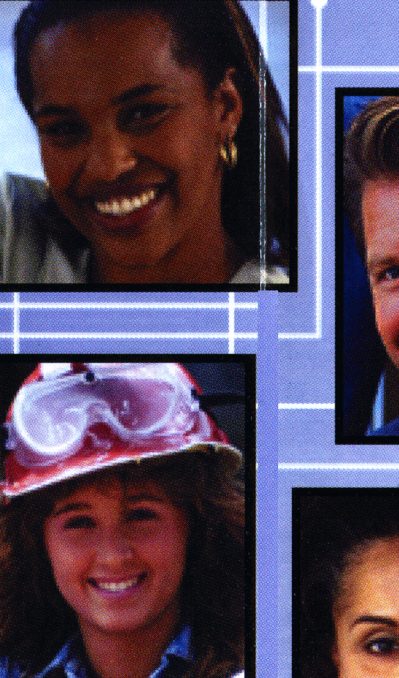
An employee can determine if he can take extended leave to care for a sick family member without losing his job.

A former US Army sergeant can determine if her years of military service entitle her to preference in Federal hiring.