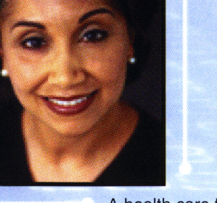
A health care facility owner can determine if the time her employees spend in training is considered hours worked.