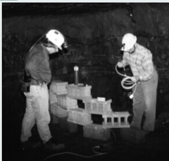
Workers test a communications receiver in an underground mine.