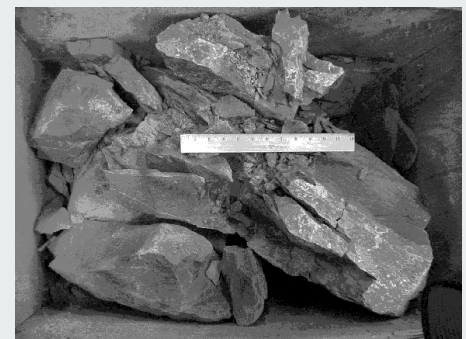
Limestone rock before and after shot.