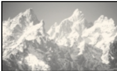
The rugged Teton - as seen from the east end of Jenny Lake.