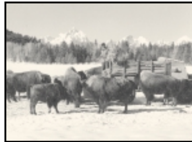
Jackson Hole Wildlife Park near Oxbow Bend. A fenced enclosure was built by the Rockefeller Foundation and operated as a game reserve, 1948 - 1968.