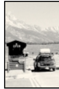
Present day Entrance Station.