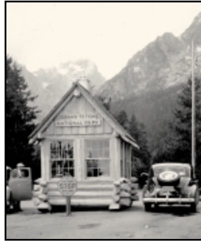
North entrance checking station, 1941.