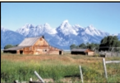
Photographic Moulton Barn on Mormon Row at Antelope Flats.