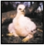
Bald Eagle Chick

wildlife and to provide for the public benefit and enjoyment by such