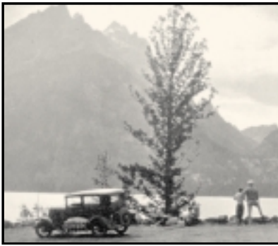
Early park roads “paved the way” for tourists in the newly created park. Shown: Jenny Lake.