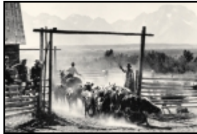
Cattle ranching was the primary occupation of most Jackson Hole residents from late 1800's thru early 1900's.