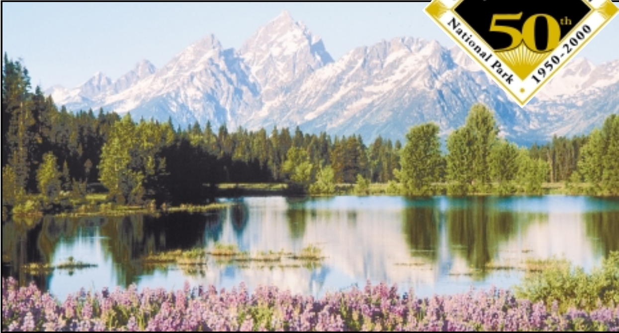
Teton Range & field of lupine.

Celebrate the Grand Legacy! Throughout 2000, we will commemorate the 50th Anniversary of Grand Teton National Park. On September 14, 1950 President Harry Truman signed a bill enlarging the park to its present size, "...for the purpose of including in one national park, for public benefit and enjoyment, the lands within the present Grand Teton National Park and a portion of the lands within Jackson Hole National Monument." This simple act ended a lengthy tug of war to secure enlargement of the original park. The struggle for present-day Grand Teton National Park required decades of compromise and defined new horizons in park preservation.