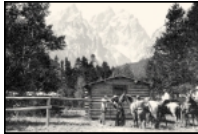
"Dudes" at the old Square G Ranch near String Lake.