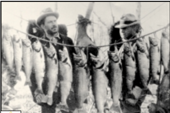
A day's catch before creel limits and regulations, late 1800's.

several books including: The Bears of Yellowstone , Mountain Time , and Searching for Yellowstone: Ecology and Wonder in the Last Wilderness . In 1999 he received the Wallace Stegner Award from the University of Colorado Center of the American West, which recognizes a sustained contribution to the cultural identity of the American West.