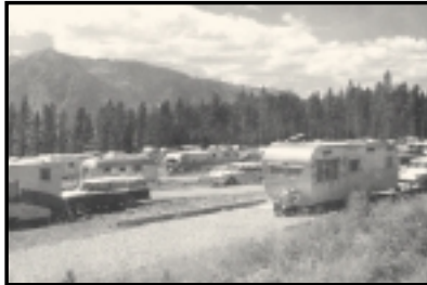
Teton camping - Trailer park at Colter Bay, 1950's.