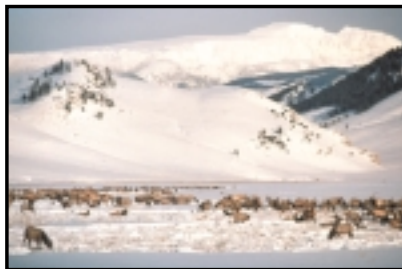
The National Elk Refuge provides winter range for approximately 7,500 elk.