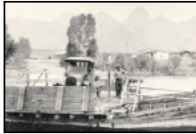
Menor's Ferry was the only crossing over the Snake River between Wilson and Moran, from 1894-1927.