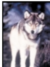
1999 - Wolves denned for the first time in over 60 years in Grand Teton National Park.

1989 - The Exxon Valdez spilled 11.2 million gallons of crude oil into Prince William Sound in Alaska creating one of the worst environmental disasters in history.