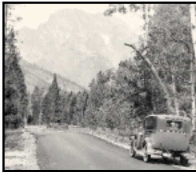
Early road in Grand Teton National Park with Mt. Moran in the distance.