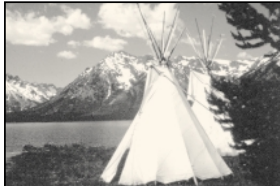
Native Americans were the first summer visitors to Jackson Hole.