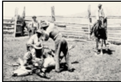
Branding time at the Elk Ranch, 1930.