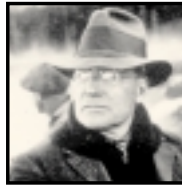
John D. Rockefeller, Jr., 1931. Provided the financial support to buy private lands and donate them to the National Park Service.