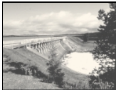
The Jackson Lake Dam was reinforced between 1984 - 1989, after failure of the Teton Dam in Idaho.

1971 - President Richard Nixon visited Grand Teton National Park.