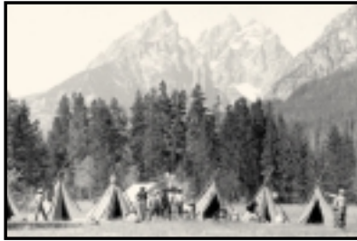
Teton camping - Early tent camp near String Lake.

Meet at Moose Visitor Center, 8 AM Migratory Bird Day - Daylong auto caravan tour with Katy Duffy, Yellowstone National Park Interpreter and GTNP naturalist, Matt Killebrew. Bring lunch and water.