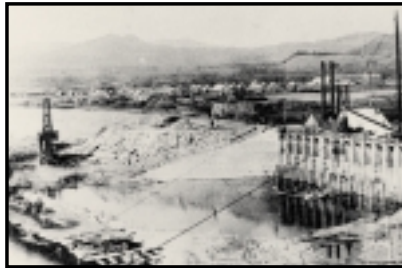
Construction of Jackson Lake Dam, 1915 and Moran townsite.