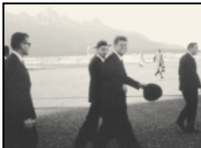
President John F. Kennedy at the Jackson Hole Airport, 1963.

1950 - Harry S. Truman signed the bill merging the 1929 Grand Teton National Park with the 1943 Jackson Hole National Monument on September 14.