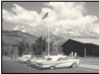
Moose Visitor Center, 1960.