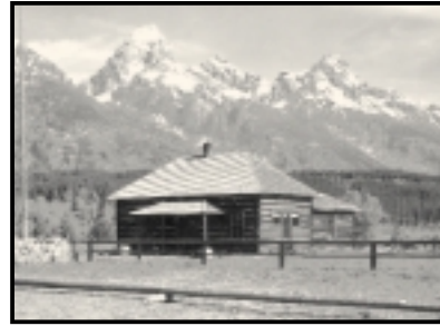
Original park headquarters at Beaver Creek, 1932.