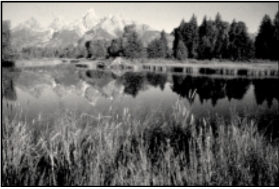
Beaver pond reflection of Tetons at Schwabacher Landing.