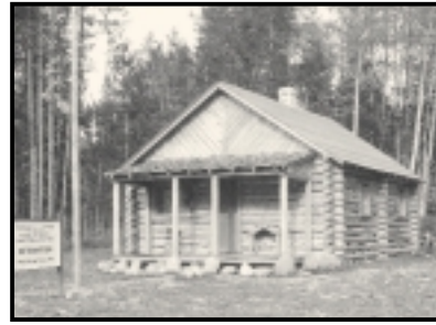
Early park information building.