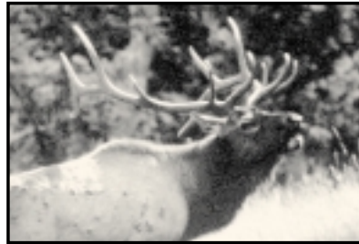
The historic elk hunt was maintained in the newly proposed park.