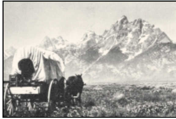
Pioneers began settling in Jackson's Hole, 1884. The first proposal to preserve this country as a national park was 1897.

The writer Donald Hough once asked a Jackson Hole old-timer, "Don't you ever get tired of looking at those same mountains?" The old man seemed puzzled by the question, and answered, "Those mountains are never the same." In contrast to the lofty sentiments of this exchange, it was also Hough who said, "The pioneers of the West, and probably the pioneers of everywhere else, rose above their fellowmen only in the epic quality of their greed."