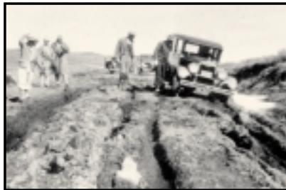
Early Yellowstone National Park roads were an adventure to travel.

1897 - Proposal made by Colonel S.B.M. Young, acting Superintendent, to expand Yellowstone's south boundary into Jackson Hole to protect migrating elk.