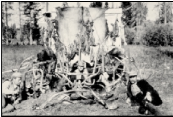
Hunters with their collection of trophies.

(Owen Wister once wrote of the Jackson Lake dam that, "There is more beauty in Jackson's Hole than even such a beastly thing could kill").