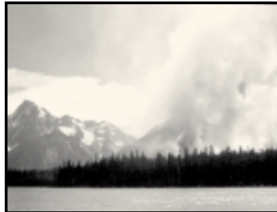
The Waterfall Canyon Fire burned approximately 3,000 acres in 1974.