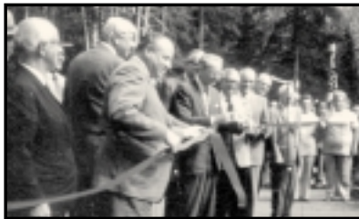
Dedication of John D. Rockefeller, Jr. Memorial Parkway, 1972. Laurence Rockefeller (son) is in center.