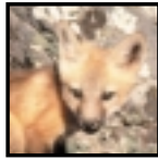
Red Fox Kit