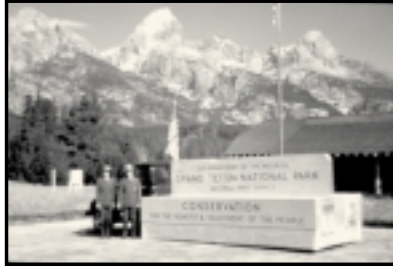
Park Service float parked in front of Headquarters at Beaver Creek, 1940.