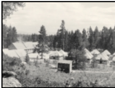
Civilian Conservation Corps (CCC) camp near Jenny Lake operated from 1934 - 1942.

Grand Teton National Park Foundation P.O. Drawer 170, Moose WY 83012 Phone: 307-732-0629