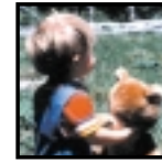
Future National Park Visitors

means and manner as to leave them unimpaired for future generations.”