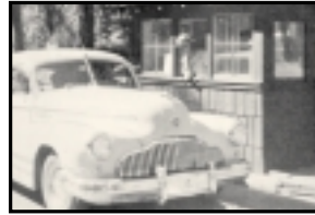
North Entrance Station, 1956.