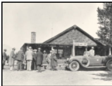
The Congressional Appropriation Committee visited Jackson Hole in 1933 with a stop at the Jackson Lake Lodge.