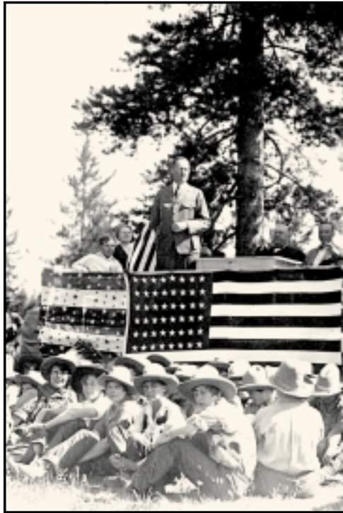
1929 - Dedication of the original Grand Teton National Park. Horace Albright, director of the National Park Service speaks to a crowd of "dudes" and locals.

to business interests intent on profit. Unsilently commercialism already intruded, and clearly this was only the beginning. With the threat of development before him, in 1927 Rockefeller committed well over a