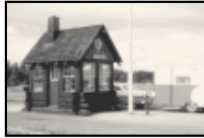
Jenny Lake, South Entrance Station, 1955.

Location and time to be announced Music of Nature Concert Series - Arranged in cooperation with Grand Teton Music Festival.