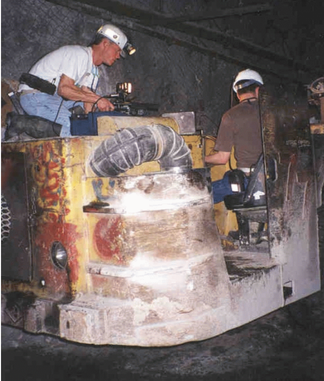
Figure 1.—Hazards In Motion.

Mention of any company name or product does not constitute endorsement by the National Institute for Occupational Safety and Health.