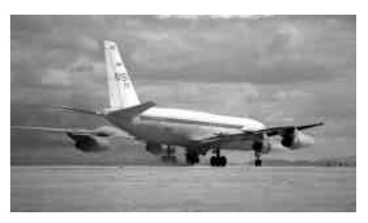
CV-990 Landing Systems Research Aircraft.

The CV-990, modified at Dryden and operated by Dryden personnel, had a landing gear retraction system installed in the lower fuselage between the aircraft's main landing gear. During tests, the shuttle test component was lowered once the aircraft's main landing gear had contacted the runway. This allowed much higher speeds and loading than the