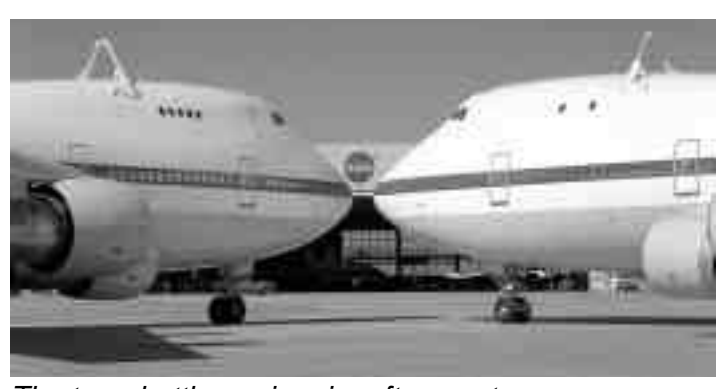
The two shuttle carrier aircraft, nose-to-nose.

The SCA is now the standard ferry vehicle.