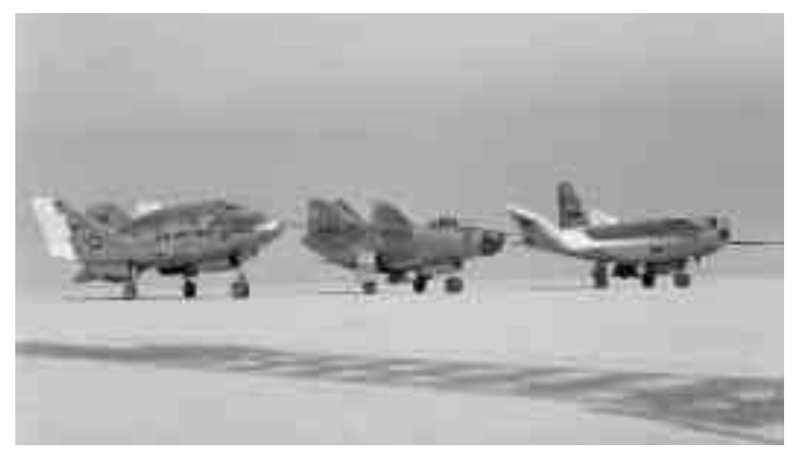
Three lifting bodies on the lakebed (X-24A, M2-F3, HL-10).

Five heavyweight designs were flown at Dryden from 1966 to 1975. They were the M2-F2, M2-F3 (rebuilt from the M2-F2 following a landing accident), HL-10, X-24A, and X-24B (rebuilt from the X-24A in a new configuration).