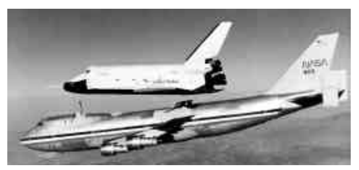
Enterprise separates from 747 SCA for first tailcone off free flight.

Four of the free flight landings were made on Rogers Dry Lake at Edwards. The final free flight landing was on the main 15,000-foot concrete runway at Edwards.