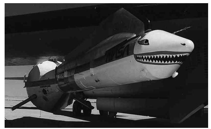
Simulated (smaller) version of the shuttle's solid rocket booster under the wing of the B-52.

The tests, using a dummy solid rocket booster, verified the performance and reliability of the parachute recovery system used now to recover the solid rocket booster casings after they separate from the shuttles' external fuel tank during launch operations. The booster casings are refurbished for reuse after they are retrieved from the ocean.