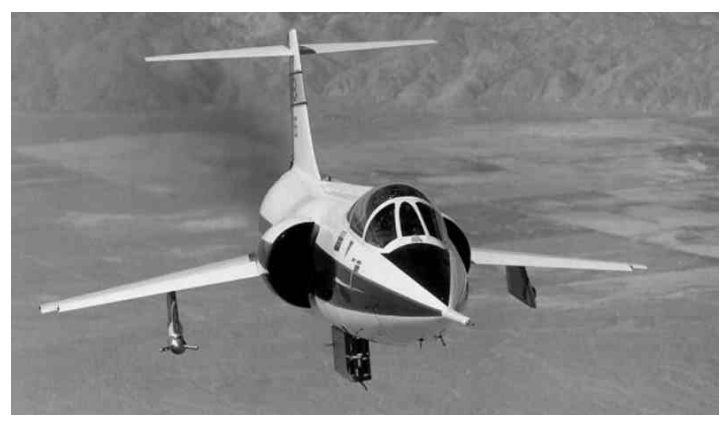
F-104 engaged in shuttle tile research.

In 1980, Dryden research pilots flew 60 flights to test space shuttle thermal protection tiles under various aerodynamic load conditions.