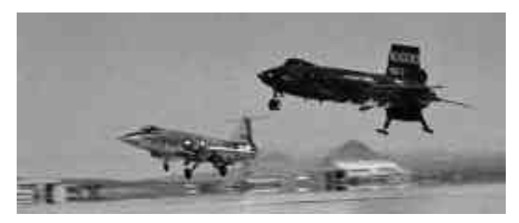
X-15 #3 and F-104A chase plane landing.

Using three research vehicles (one was lost in an accident late in the program), 12 pilots assigned to the program at the Flight Research Center collected a wealth of data between 1959 and 1968 on 199 research flights. Much of this information fanned out across the aerospace industry and has been applied to commercial and military aircraft and to the nation's space programs.