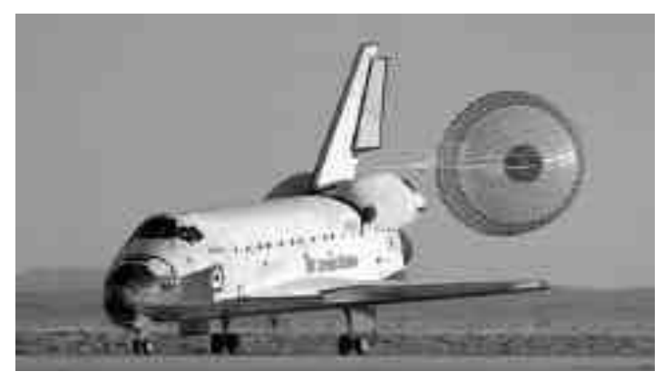
The space shuttle Atlantis lands with its drag chute deployed on Runway 22 at Edwards, Calif., to complete the STS-66 mission.

Rosamond Dry Lake at Edwards Air Force Base also has two lakebed runways available for special landings, if needed.