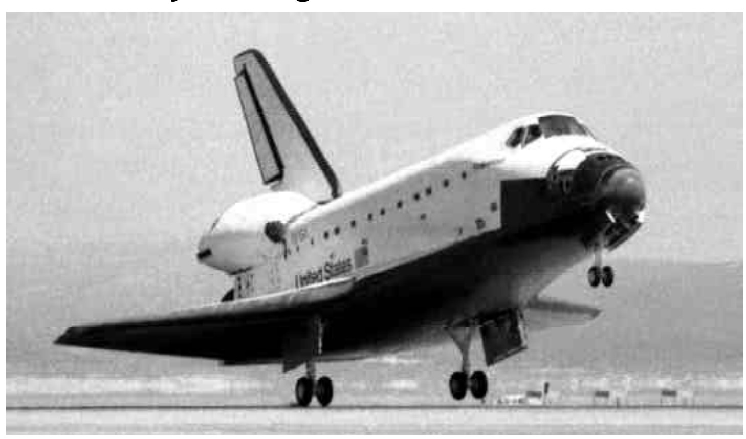
STS-67 Endeavour landing at Edwards.

Among the most prominent aerospace projects associated with the NASA Dryden Flight Research Center, Edwards, Calif., is the Space Transportation System (STS) — the space shuttles developed and operated by NASA.