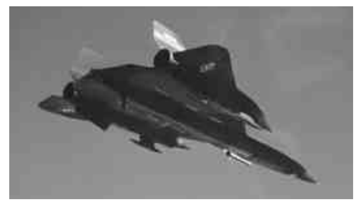
YF-12A in flight with "cold wall" experiment.

In 1972, Dryden began research flights with the first aircraft equipped with an all-electric, digital flight control system. This was the F-8 Digital Fly-By-Wire, which used electrical impulses instead of mechanical means to link cockpit controls and actuators moving the rudder, elevators, and ailerons. This same all-electric F-8 was used to test and verify the computer hardware and software used in the space shuttle's flight control system before the first orbital flights began.