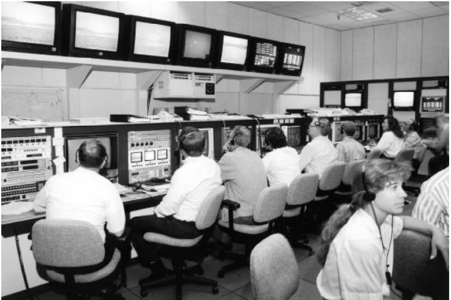
NASA researchers in gold control room during an F-15 HIDEC Flight

Using this information, ADECS freed up engine performance that would otherwise be held in reserve to meet the stall margin requirement. Improved engine performance obtained through ADECS could take the form of increased thrust, reduced fuel usage, or lower engine operating temperatures because peak thrust was not always needed.