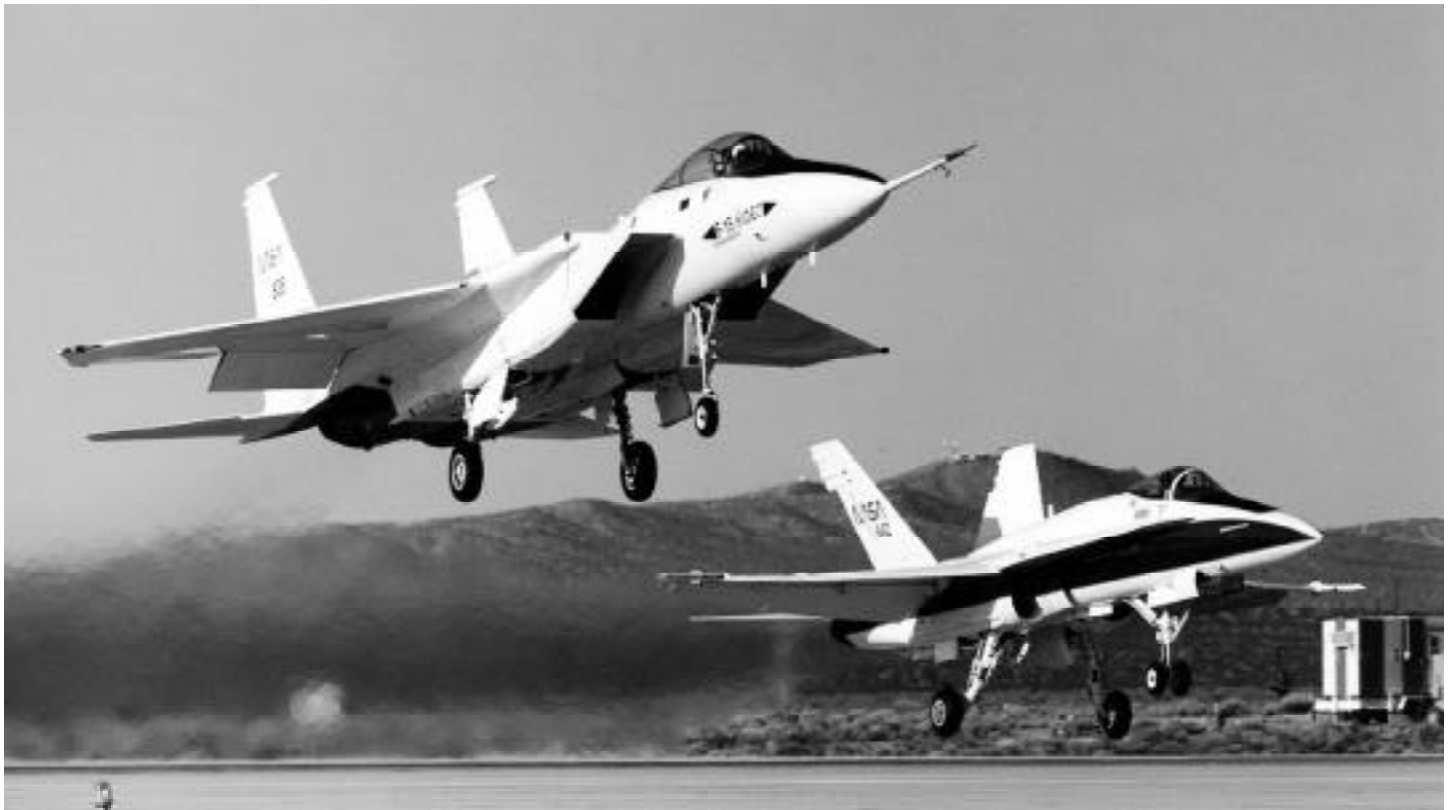
F-15 HIDECA landing with F/A-18 chase aircraft

Flight research carried out by NASA with a highly modified F-15 aircraft demonstrated and evaluated advanced integrated flight and propulsion control system technologies that will help make next-generation aircraft more maneuverable, more fuel efficient, and safer to fly.