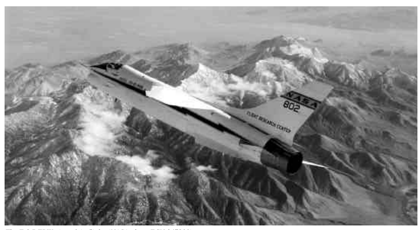
The F-8 DFBW aircraft in flight.

The Digital Fly-By-Wire (DFBW) concept uses an electronic flight-control system coupled with a digital computer to replace conventional mechanical flight controls.