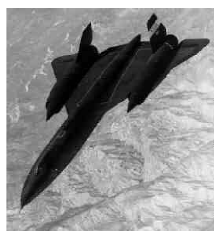
(52253.83 kilograms), including a fuel weight of 80,000 pounds (29859.33 kilograms).

As research platforms, the aircraft can cruise at Mach 3 for more than one hour. For thermal experiments, this can produce heat soak temperatures of over 600 degrees (F). The aircraft are 107.4 feet (32.73 meters) long, have a wing span of 55.6 feet (16.94 meters, and are 18.5 feet (5.63 meters) high (ground to the top of the rudders when parked). Gross takeoff weight is about 140,000 pounds