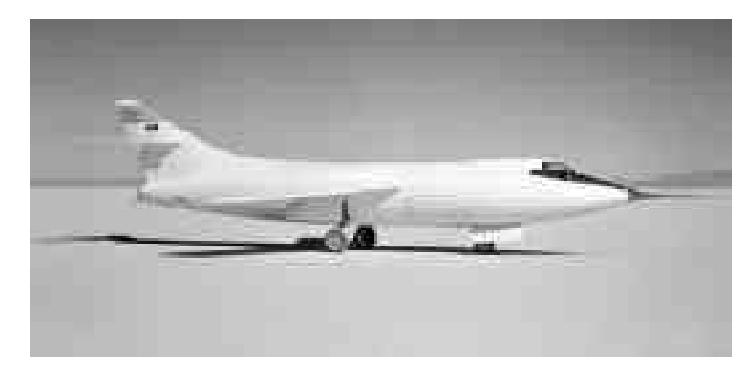
D-558-II Skyrocket on the Lakebed at Edwards AFB.