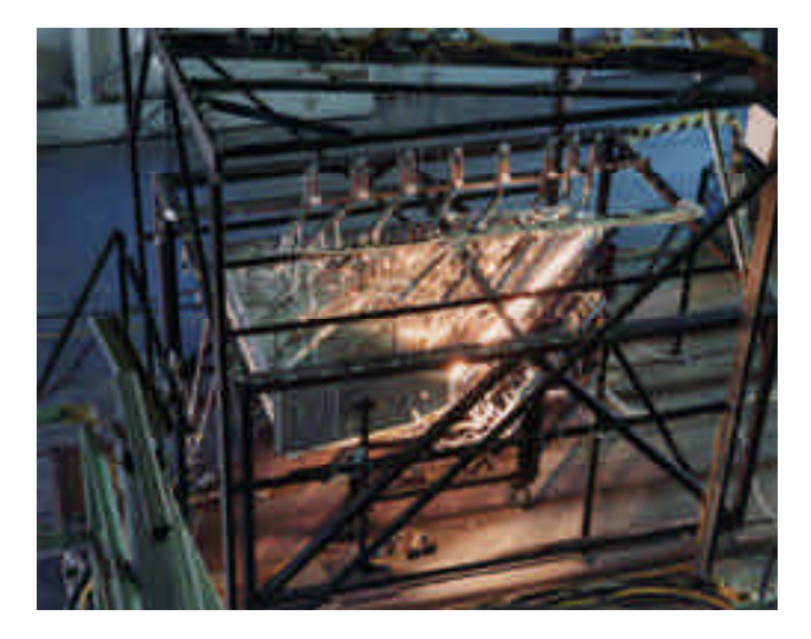
The experimental glove is made of nickel-plated steel and carries pressure and temperature instrumentation, among other instruments.

The flight-test glove is mounted on balsa wood and surrounded by a drag-reducing thermal protection system structure made of Space Shuttle tile material that blends the glove into the wing. NASA Ames Research Center, Moffett Field, CA, supplied the thermal protection system, which dissipates heat. The glove was mounted to the Pegasus<sup>®</sup> wing at Dryden. The Pegasus booster rocket will be secured to its L-1011 launch vehicle at the Orbital Sciences Corp.'s Vehicle Assembly Building at Vandenberg Air Force Base, CA