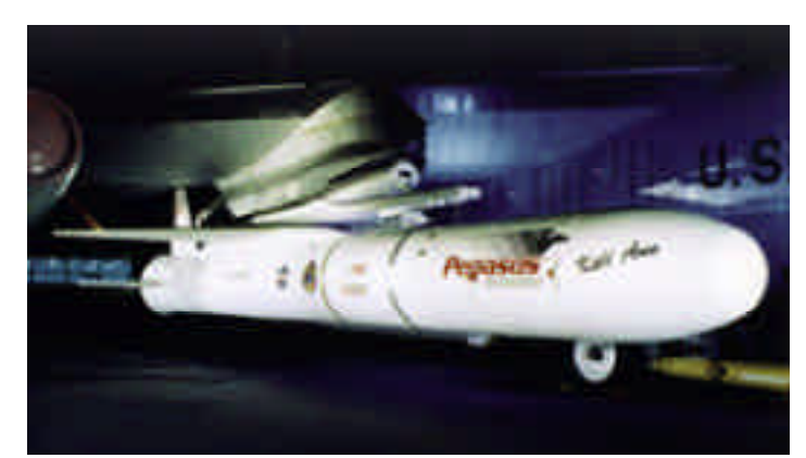
The Orbital Sciences Corp.'s Pegasus booster rocket is mated to Dryden's B-52. Orbital's L-1011 now serves as the Pegasus mothership.

The hypersonic X-15 experienced such problems due to turbulence-induced friction. In addition, turbulent air creates more "drag," slowing down aircraft or making them less efficient.