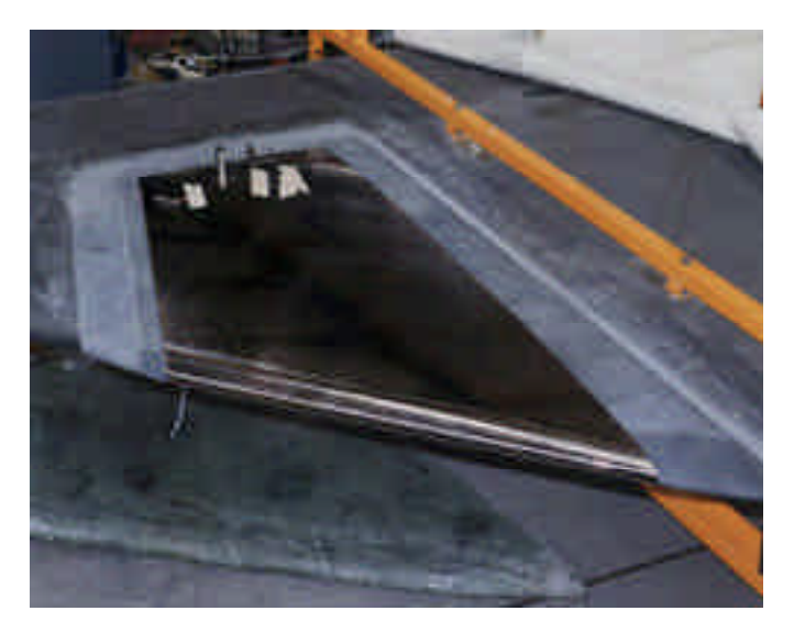
The nickel-plated steel glove, shown here undergoing heat tests in 1996, is bonded to the right wing and wraps from the underside of wing, over the leading edge and onto the upperside, although it does not cover the wing completely.

The glove carries a variety of traditional and highfrequency sensors capable of functioning during the flight conditions the Pegasus® rocket will experience. The sensors will give engineers a variety of information like acceleration, air flow, pressure, temperature and strain. Many of these sensors were evaluated in July 1994 aboard an earlier Pegasus® mission. The mission verified that the sensors do not interfere with the airflow over the Pegasus® wing and that the vibrations the sensors will experience during flight will not interfere with obtaining accurate data.