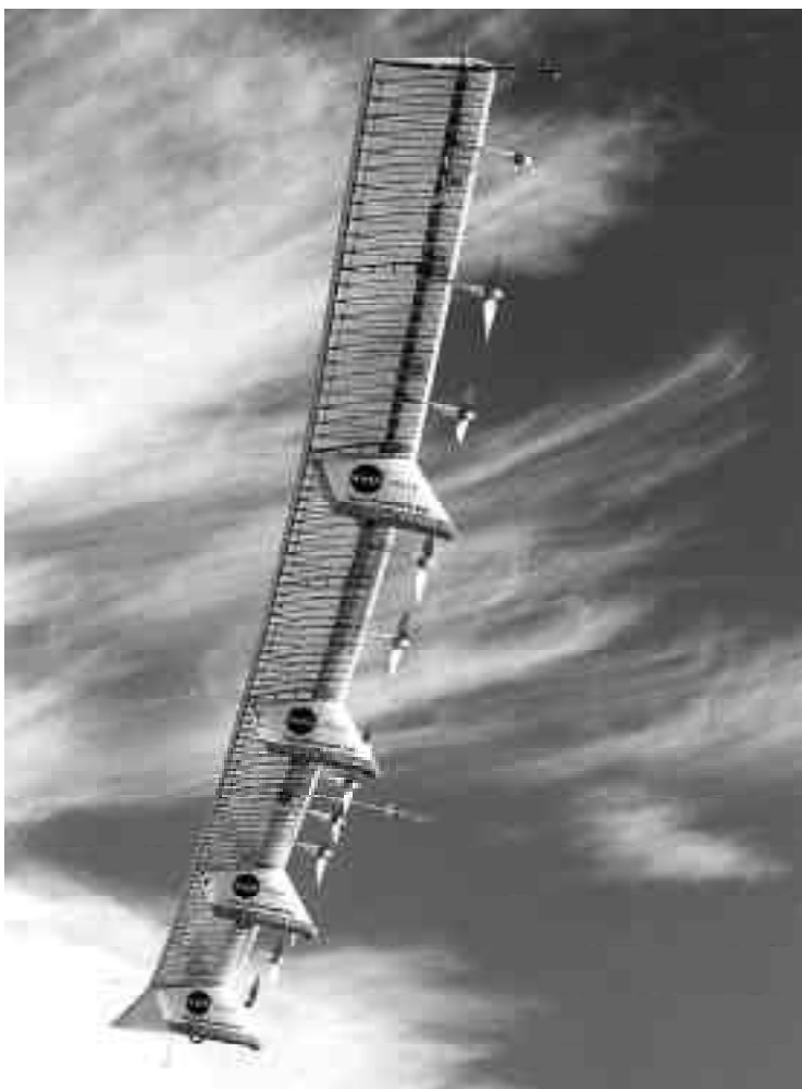
Centurion in flight, NASA photo by Tom Tschida.

Centurion has been designed to not only reach extreme altitudes, but to do so while carrying 100 pounds of remote sensing and data collection instruments for use in scientific studies of the Earth's environment. It also is capable of carrying 600 pounds of sensors, telecommunications and imaging equipment up to 80,000 feet altitude, and of performing multi-week flights at the north or south poles during summer.