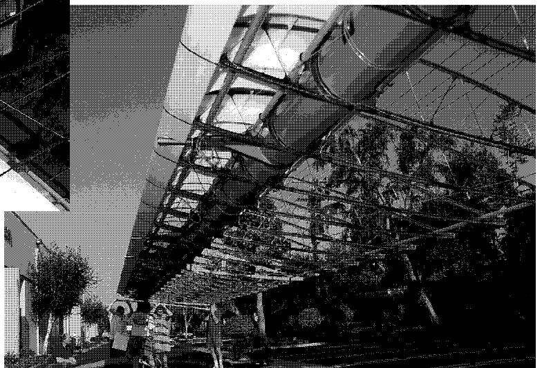
Assembly of the Centurion structure at AeroVironment's Simi Valley Design and Development Center

Although it shares many of the design concepts of the Pathfinder, the Centurion has a wingspan of 206 feet, more than twice the 98-foot span of the original Pathfinder and 70 percent longer than the Pathfinder-Plus' 121-foot span. At the same time, it