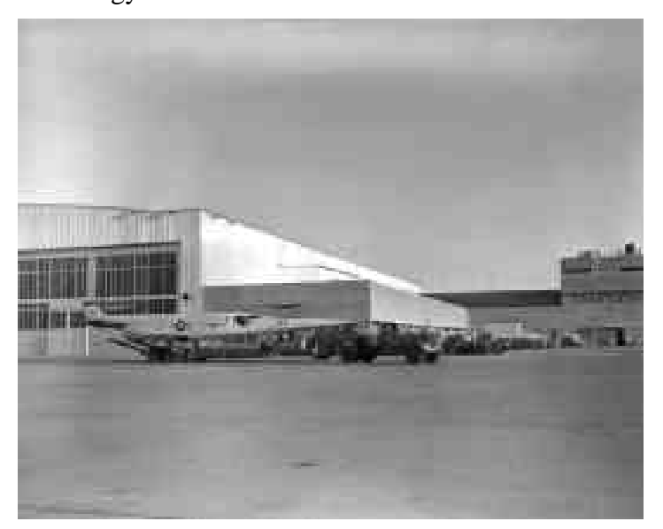
NASA Photo E-2274. X-3 towed to lakebed

For the X-3, the roll coupling flight was the high point of its history. The aircraft was grounded for nearly a year after the flight, and never again explored its roll stability and control boundaries. Walker made another 10 flights between September 20, 1955, and the last on May 23, 1956. The aircraft was subsequently retired to the Air Force Museum. Although the X-3 never met its intention of providing aerodynamic data in Mach 2 cruise, its short service was of value. It showed the dangers of roll coupling, and provided early flight test data on the phenomena. Its wing platform was used in the F-104, and it was one of the first aircraft to use titanium. Finally, the X-3's very high take off and landing speeds required improvements in tire technology.