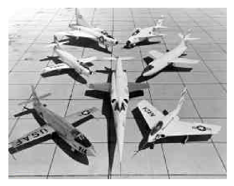
NASA Photo E-2889. NACA Research Aircraft: Bell X-1A, D-558-1, XF-92A, X-5, D-558-2, X-4, and X-3.

X-3 sideslipped, resulting in a loading of 2 Gs. Walker managed to bring the X-3 under control and successfully landed.