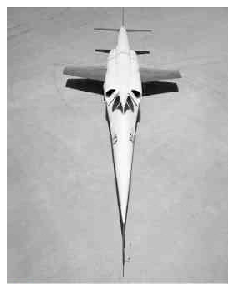
NASA Photo E-1227. X-3 stiletto on Ramp.

On October 27, 1954, Walker made an abrupt left roll at Mach 0.92 and an altitude of 30,000 feet. The X-3 rolled as expected, but also pitched up 20 degrees and yawed 16 degrees. The aircraft gyrated for five seconds before Walker was able to get it back under control. He then set up for the next test point. Walker put the X-3 into a dive, accelerating to Mach 1.154 at 32,356 feet, where he made an abrupt left roll. The aircraft pitched down and reached a g-loading of -6.7, then pitched upward to +7 Gs. At the same time, the