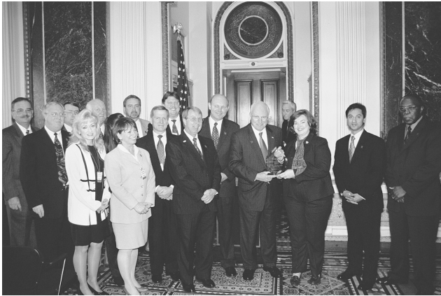
The United States Postal Service – Southeast Area’s investment in energy efficiency improvements will total more than $21 million over the next 5 years and generate annual energy cost savings of approximately $4 million.

The Southeast Area’s Energy Steering Committee produced and implemented a Strategic Energy Management Plan that embraces many of the tools of Executive Order 13123. The results show that the Southeast Area’s successful implementation of these tools has saved significant amounts of both energy and financial resources.