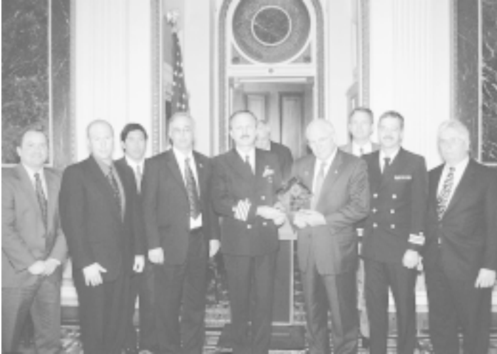
The Navy Region Southwest's (NRSW's) demand-side management initiatives spearheaded by NRSW's Regional Energy Program Office helped avert Stage 3 alerts and regional rolling outages.

Navy Region Southwest (NRSW) formed a Regional Energy Program Office (REPO) in response to spiraling electricity prices and electricity shortages in Southern California. The demand-side management initiatives spearheaded by the REPO helped the local utility avert Stage 3 alerts and regional rolling outages.