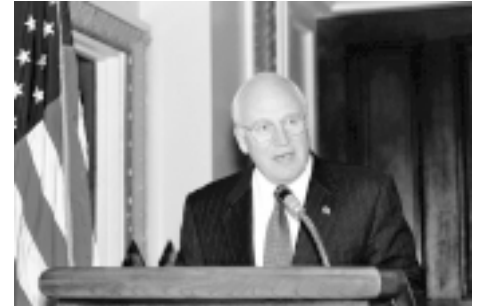
Vice President Dick Cheney speaks at the second annual Presidential Awards for Leadership in Federal Energy Management.

"This Administration is committed to more efficient energy management. In President Bush's May 3rd Memorandum to all Departments and Agencies, he stated that the Government should, ' . . . set a good example of conservation, by reducing its own energy use, particularly in regions where electricity shortages occur and during peak electricity demand.' We've reduced the Government's energy bill by $150 million a year in buildings alone. We've done it with off-the-shelf technologies—with thousands of energy-efficient light bulbs, occupancy sensors, ENERGY STAR® office equipment, and energy efficient windows."