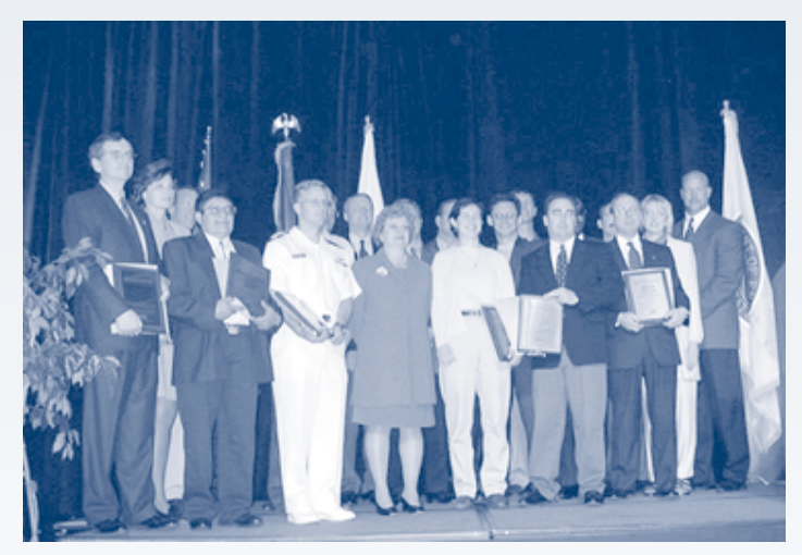
Presentation of 2001 Federal Energy Saver Showcase Awards.

This Leadership in Energy and Environmental Design (LEED)-certified sustainable design project, the first of its kind for the Navy, entailed design and construction of nine new dormitory facilities to house more than 2,000 sailors. As part of the sustainable design process, energy efficiency goals were established and the project was designed to minimize impact on undeveloped land and make use of existing utilities and transportation infrastructure.