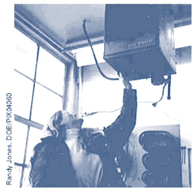
A SAVEnergy auditor inspects a unit heater at the Great Sand Dunes National Monument.

Often, SAVEnergy audits help to launch new partnerships. An audit recently obtained by the Department of Commerce's National Oceanic and Atmospheric Administration (NOAA) at the National Marine Fisheries Service in La Jolla, California, identified a comprehensive array of cost-effective ECMs. However, like many other agencies, NOAA did not have enough appropriated funds to implement the measures. But NOAA did have the SAVEnergy audit report that indicated the project's potential for savings.