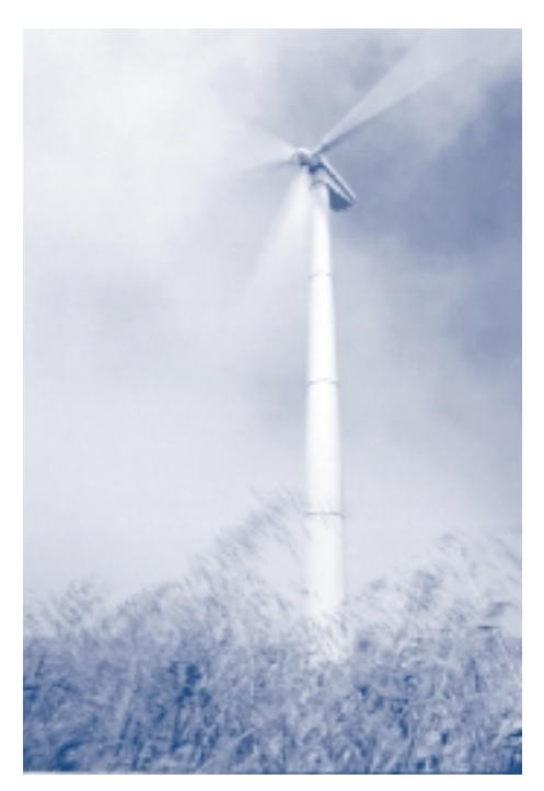
One of three 225-kilowatt wind turbines generates electricity for the Navy on San Clemente Island off the coast of California.

The Energy Project Development and Execution Team is responsible for performing (or contracting for) audits, and identifying and executing all fundable