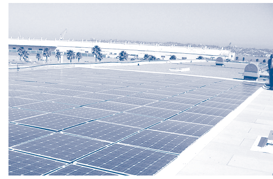
A 21.6 kilowatt photovoltaic system on Bldg 678, Naval Air Base Coronado, California.

With annual electric consumption at 800,000 megawatt hours, the U.S. Department of the Navy is San Diego Gas & Electric's (SDG&E) largest customer. Public Works Center San Diego's peak demand of 130 megawatts, represents 3% of SDG&E's peak load and 0.3% of all the peak load in California.