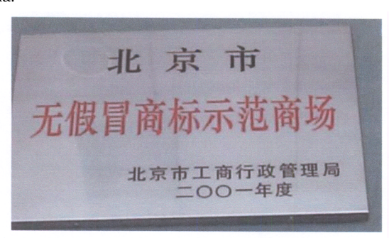
Beijing Administration for Industry and Commerce Sign: "Model Market for No Counterfeit Trademarks, 2001"

Science and Civilization in China. Looking to the future, China has indeed committed significant resources to revamping its laws, establishing a specialized IP court system, implementing specialized administrative agencies with power to fine infringers, and enacting and publicizing laws or measures that may extend beyond TRIPS minima.