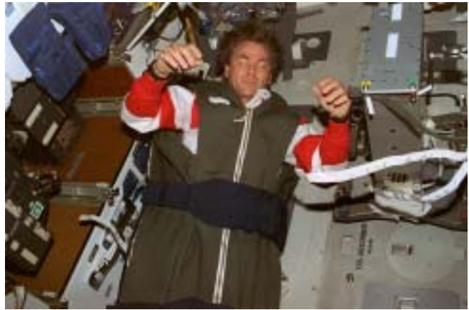
During mission STS-85, Payload specialist Bjarni V. Tryggvason, representing the Canadian Space Agency, sleeps on the Space Shuttle Discovery's mid-deck floor with his arms free-floating. Tryggvason elected to not use a pillow, allowing his head to float freely in the Microgravity environment.

Enhancements to the suit to better prepare it for assembly and use aboard the station include: easily replaceable internal parts; reusable carbon dioxide removal cartridges; metal sizing rings that allow in-flight suit adjustments to fit different crew members; new gloves with enhanced dexterity; a new radio with more channels to allow up to five people to talk at one time; warmth enhancements such as fingertip heaters and a cooling system shutoff; new helmet-mounted flood and spot lights; and a jet-pack "life jacket" called SAFER to allow an accidentally untethered astronaut to fly back to the station in an emergency.