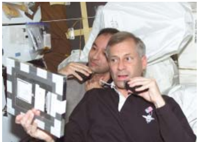
February 2001, STS-98 Pilot Mark L. Polansky (left) and Commander Kenneth D. Cockrell share a mirror shaving their faces on the mid-deck of the Space Shuttle Atlantis.

digestive elimination. The orbiter travelers use a toilet that operates very much like one on Earth. A steady flow of air moves through the unit when it is in use, carrying wastes to a special container or into plastic bags. The container can be opened to vacuum, which exhausts the water and dries the solids, and the plastic bags, when used, can be sealed.