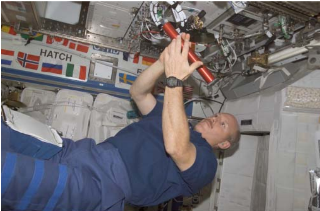
Astronaut Kenneth D. Bowersox, Expedition Six mission commander, works with an experiment cartridge for the Zeolite Crystal Growth (ZCG) experiment in the Destiny laboratory on the International Space station, Dec. 17, 2002.

The ISS assigned operating altitude is 250 miles (354 kilometers) above mean sea level, with an inclination to the equator of 51.6 degrees.