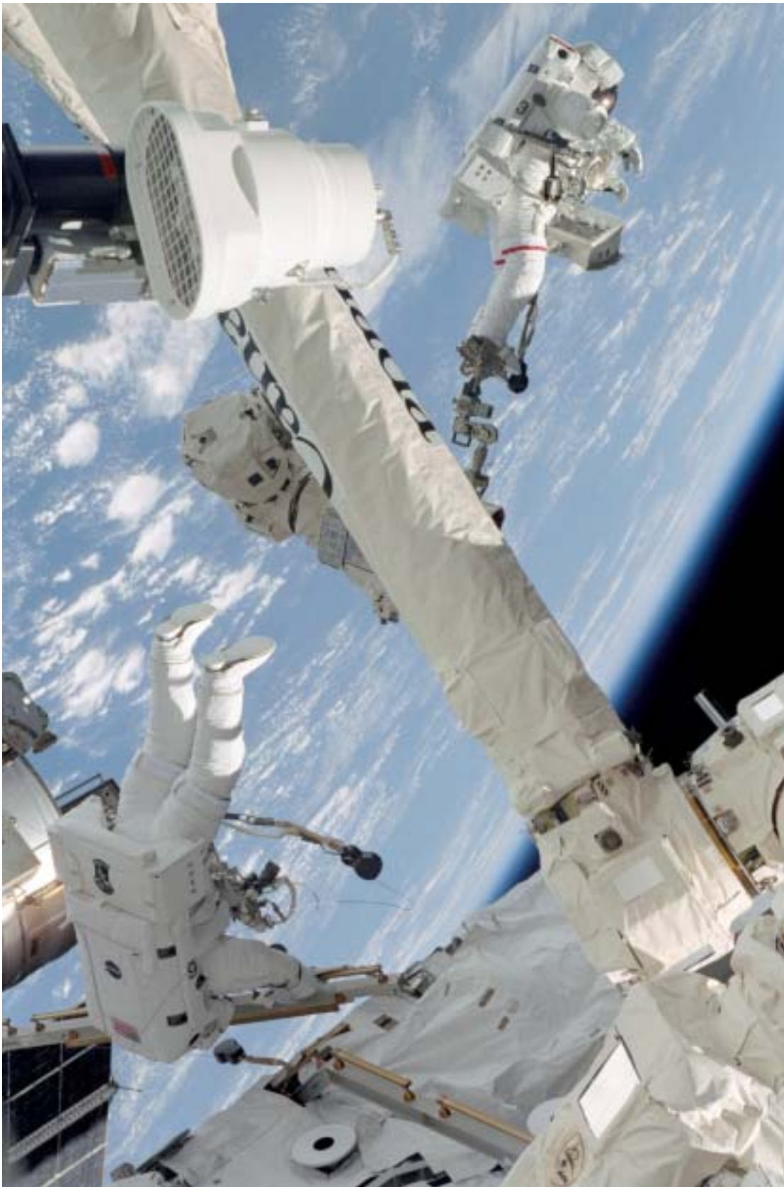
Oct. 12, 2002, astronauts David A. Wolf (left) and Piers J. Sellers, both STS-112 mission specialists, participate in the mission's second session of extravehicular activity (EVA). Wolf is anchored to a foot restraint on the International Space Station's (ISS) Canadarm2 while Sellers traverses along the airlock spur, a route used by spacewalkers to get from the Quest airlock on the station to the outpost's truss.