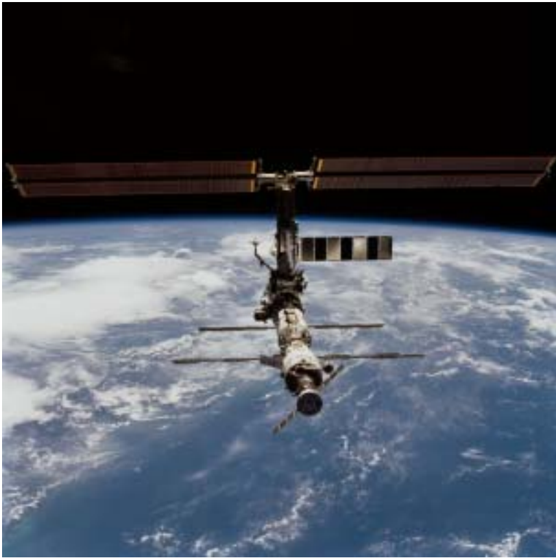
The International Space Station in 2001.

Space Shuttle Atlantis carries the S1 Integrated Truss Structure and the Crew and Equipment Translation Aid (CETA) Cart A to the ISS on mission STS-102 in October 2002.