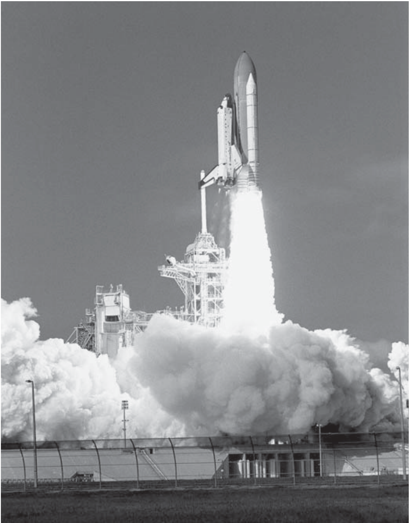
Flagship of the Shuttle fleet, Columbia lifts off on its final mission to space, Jan. 16, 2003, at 10:39 a.m. EST, with a crew of seven.