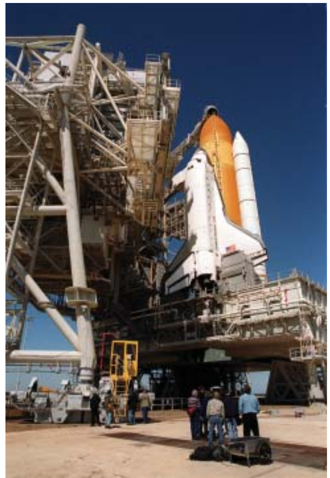
The RSS rolls back to allow access to the Shuttle on the pad.

An orbiter midbody umbilical unit provides access and services to the midfuselage portion of Discovery. Liquid oxygen and liquid hydrogen for the vehicle’s fuel cells, and gases, such as nitrogen and