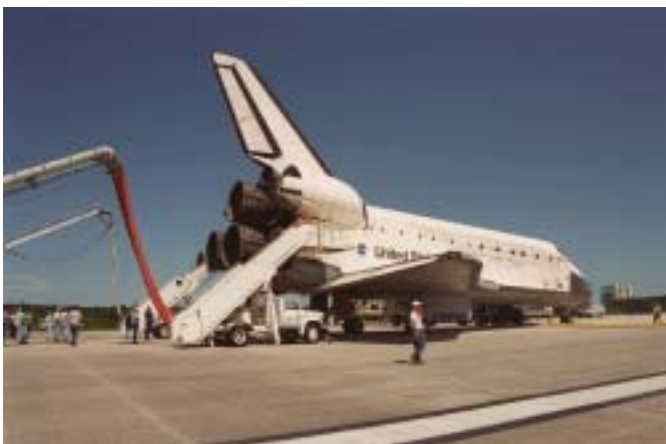
Umbilicals are attached to purge the vehicle of any possible residual explosive or toxic fumes.

Once the forward and aft safety assessment teams successfully complete their toxic vapor readings around the orbiter, Purge and Coolant Umbilical Access Vehicles are moved into position behind the orbiter to gain access to the umbilical areas. Checks for toxic or hazardous gases are completed in the areas