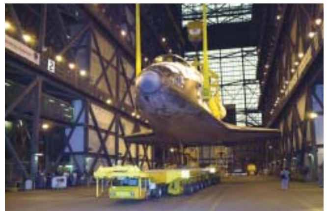
Discovery is lifted off the transporter by an overhead crane in the transfer aisle of the VAB

One of the world's largest buildings by volume, the VAB covers eight acres. It is 525 feet tall, 716 feet long, and 518 feet wide. It is divided by a transfer aisle running north and south that connects and transects four high bays. Facing east toward the launch pads are bays 1 and 3, used for the vertical assembly of Space Shuttle vehicles. On the west side of the VAB are Bays 2 and 4, used for flight hardware and orbiter storage.