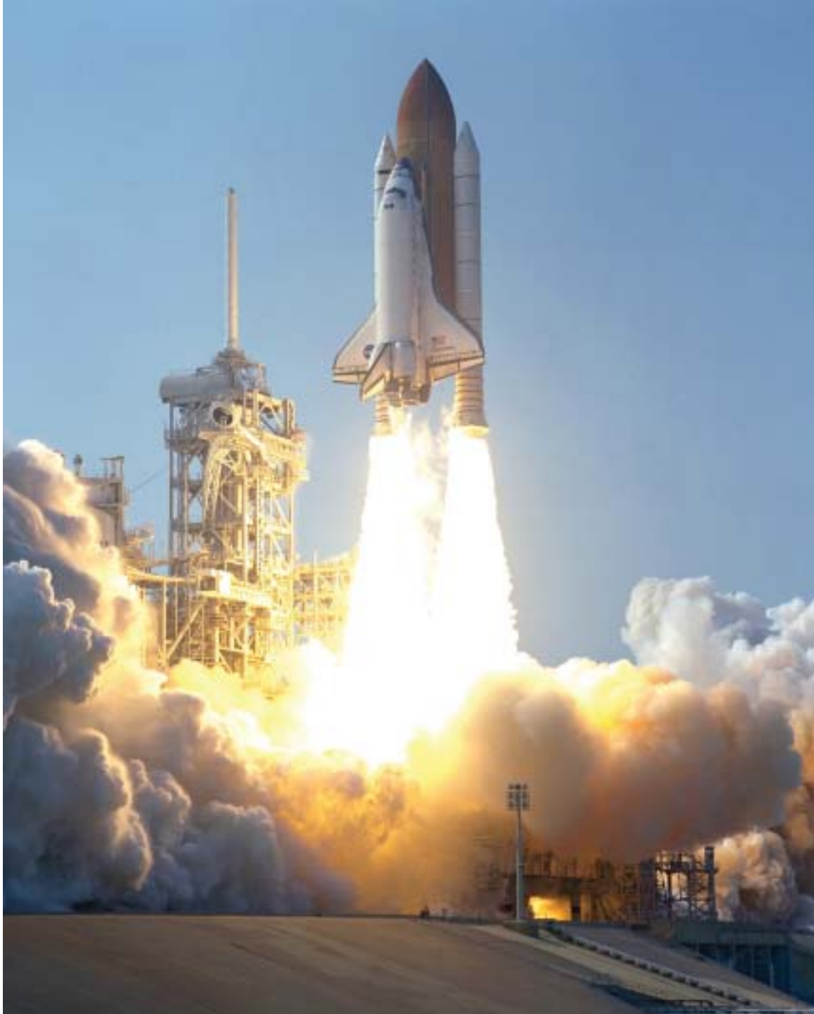
Discovery lifts off Aug. 10, 2001, on mission STS-105, an assembly flight to the International Space Station.

After the mission, the Shuttle lands and the processing sequence for the next mission begins again.