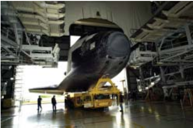
Discovery rolls into the Orbiter Processing Facility where it will be processed for another flight.

A tractor tow vehicle pulls Discovery along a two-mile tow-way from the SLF to the Orbiter Processing Facility (OPF), a structure similar in design to a sophisticated aircraft hangar, where processing Discovery for another flight begins. The OPF has three separate buildings, or bays, that are each about 197 feet long, 150 feet wide and 95 feet high. Each is equipped with two 30-ton bridge cranes with a hook height of approximately 66 feet. High bays 1 and 2 are adjacent to each other. High bay 3 was constructed north of the VAB.