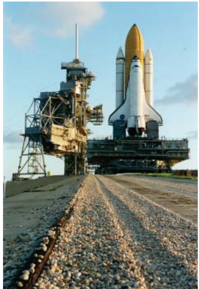
Discovery arrives at the launch pad via the crawler-transporter.

The transporters have a leveling system designed to keep the top of a Space Shuttle vehicle vertical within plus or minus 10 minutes of one degree of arc having the dimensions of a basketball. This system