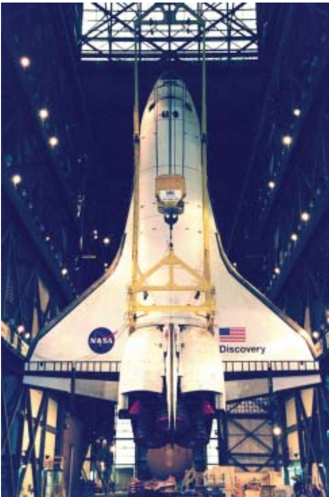
Discovery is lifted to vertical for stacking with the external tank and solid rocket boosters.

faces is performed; a shuttle interface test verifies Discovery's interfaces and vehicle-to-ground interfaces are working. Umbilical ordnance devices are installed (but not electrically connected until Discovery is at the pad).