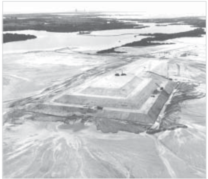
Dredged sand created the 80-foot high mound that would become launch pad A.

To deliver the first and second stages of the Saturn V, water was deemed the best carrier. For delivery close to the launch pad, a barge canal and turn basin near the VAB was needed. The Gahagan Dredging Corporation of Tampa dredged a canal measuring 124.7 feet (38