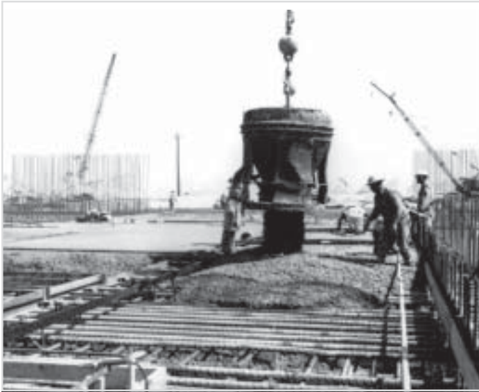
Pouring the concrete floor for the VAB.

The pipe for the piling came in 16.8-meter lengths, and welders had to join three and sometimes four lengths of pipe together to make up a single pile. To speed the work, workmen welded at night, then drove the piles, which required better visibility, during the day. At the peak of activity, 10 pile drivers were in action. Three of