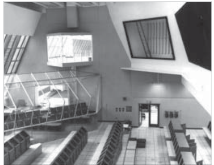
Firing room 1 under construction, August 1965. The VIP viewing area is under the glass wall, left. The windows on the extreme left looked towards the pads. The triangular extension into the room above the VIP area was intended for the most distinguished guests.

The original plan of the launch control center called for four rectangular firing rooms, 28 by 46 meters; one was never to be equipped. When completed, the firing rooms contained similar equipment set up on four levels. The first level took up over two-thirds of the room and would ultimately contain computers and five rows of 30 consoles each. Two rows of consoles (27 in one, 25 in the other) would fill the second level. The third level would contain the consoles of the Kennedy Space Center Director and other major officials. To the left of these consoles, two diagonal rows of seats with telephones and listening devices, but no control equipment, would provide a close-up view of operations for technical experts not directly involved in the launch.