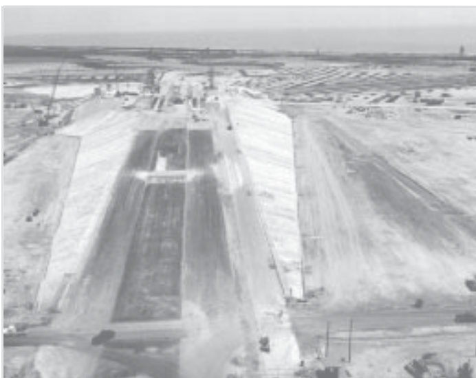
The flame trench bisects the launch pad.

Bisecting the pad would be a flame trench, level with the surrounding area at its base, measuring 59 feet (18 meters) wide and 449.5 feet (137 meters) long. On each side of this flame trench, a cellular structure would support a thick surface, called a hardstand. Eventually, a mobile launcher and the Apollo-Saturn vehicle would be placed on top of this reinforced slab for launch.