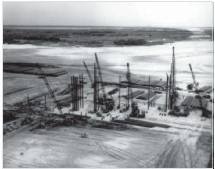
Driving the pilings for the VAB.

Foremost in the construction timeline was the Vertical Assembly Building, as it was originally named. The $23.5 million contract called for more than 45,000 metric tons of structural steel and the erection of the skel-