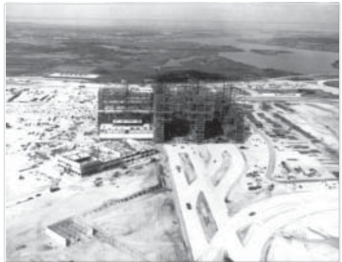
The VAB rises in steel to dominate the landscape. On the left is the lower launch control center. In the foreground is the crawlerway.

That solution, however, created another issue. The building stood only a few feet above sea level and near the ocean. Salt water, saturating the subsoil, reacted with the steel piling to create an electrical current. To prevent this electrolytic process from gradually eating away the steel pipe, the pilings were grounded by weld-