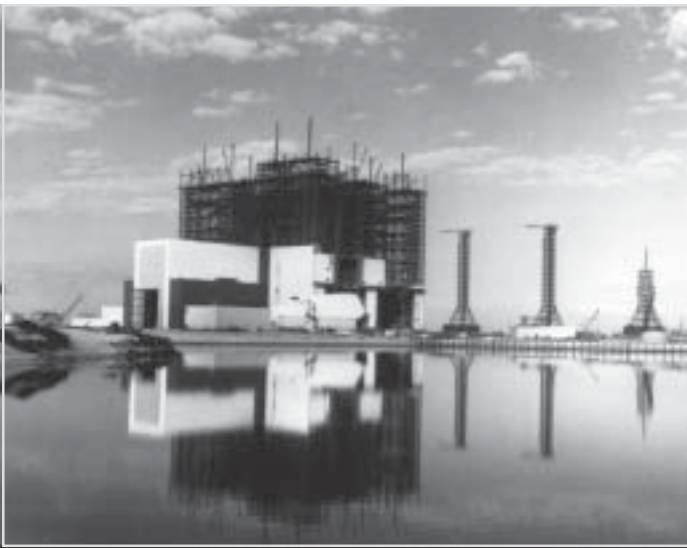
Mobile launchers are visible to the right of the VAB; the launch control center, center, seems to be part of the VAB.

tric cables, each 50 millimeters in diameter, and about 44 fluid service lines, ranging from 12 to 25 millimeters thick, went into a single umbilical carrier. Each arm would be wide enough for a jeep to drive across -- though none ever was to do so. Their length varied with the configuration of the vehicle; they would average over 22 metric tons in weight.