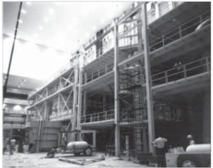
Interior of operations and checkout building, August 1965. The two partly visible silos at left are altitude chambers.

Designers began drawings for a clean room, or white room, for the Gemini program. This was a dust-free room with high quality temperature and humidity controls to prevent contamination of the space vehicle. The air intakes would have special filters. All persons who entered the room would wear clothing resembling surgical uniforms. It would be located in the O & C Building's assembly and test area.