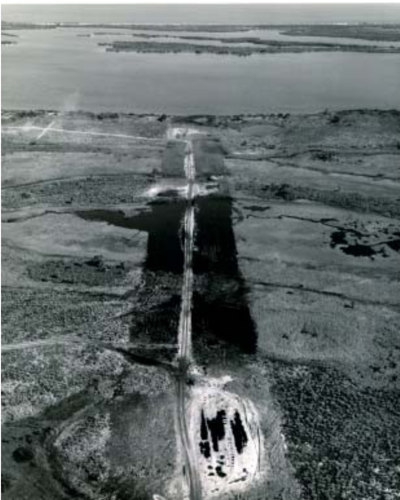
Aerial of the VAB site (foreground) and road to pad 39C (later pad A) during dredging of access channel, Jan. 23, 1963.